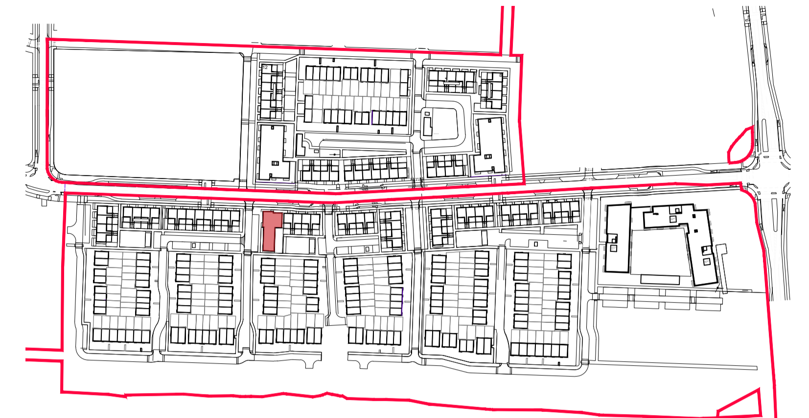
KEY PLAN - NTS