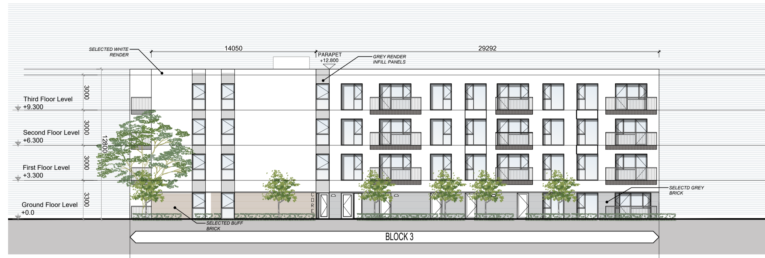
BLOCK 3 - EAST ELEVATION Scale 1:200@A1