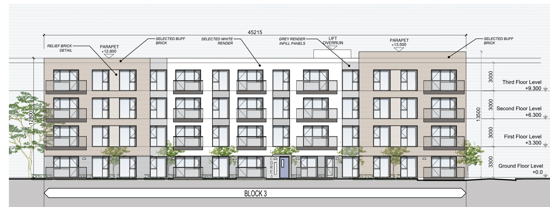
BLOCK 3 - WEST ELEVATION Scale 1:200@A1