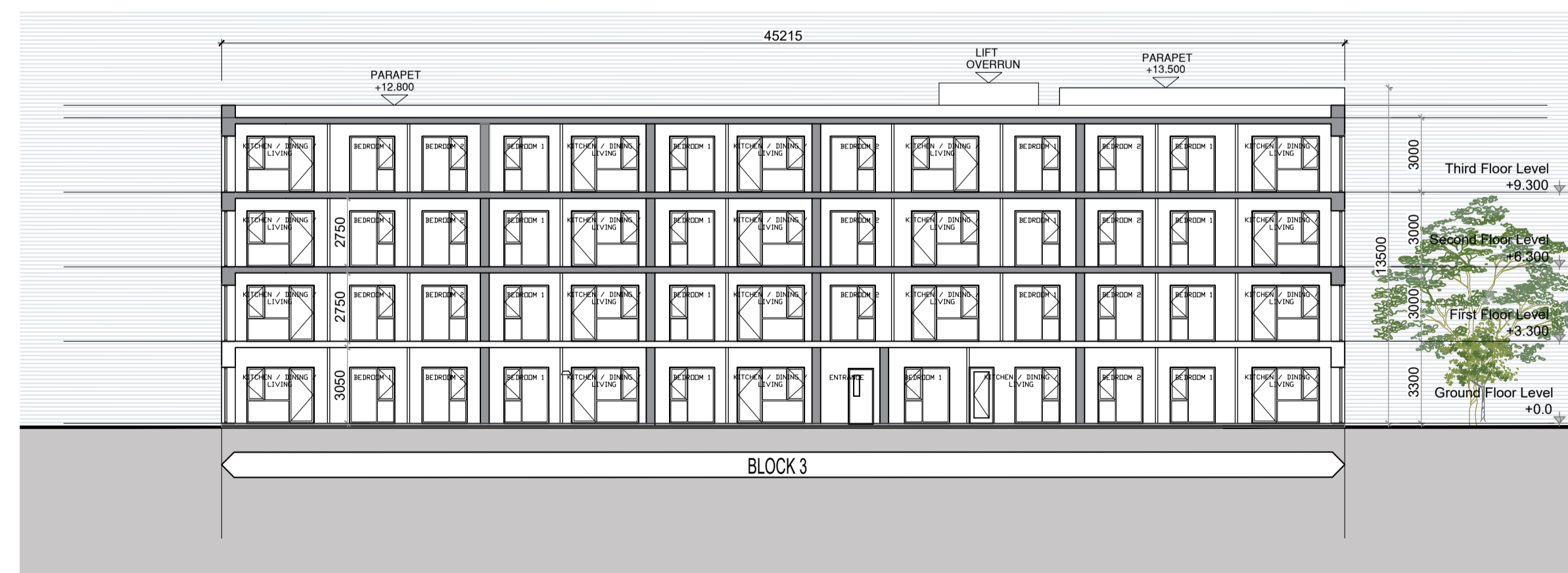
BLOCK 3 - SECTION Scale 1:200@A1