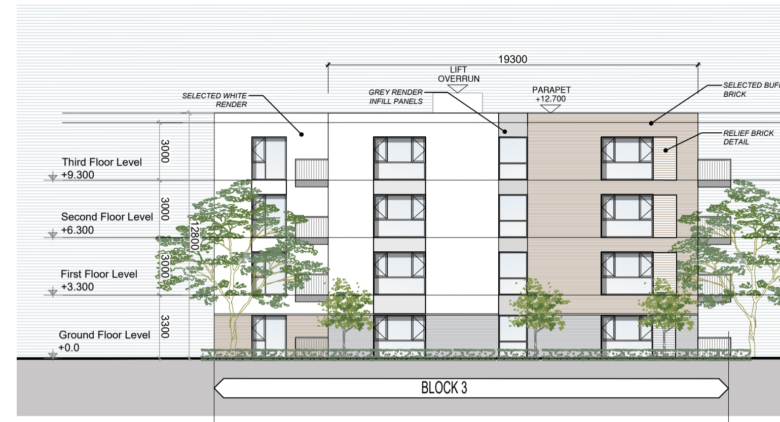
BLOCK 3 - NORTH ELEVATION Scale 1:200@A1