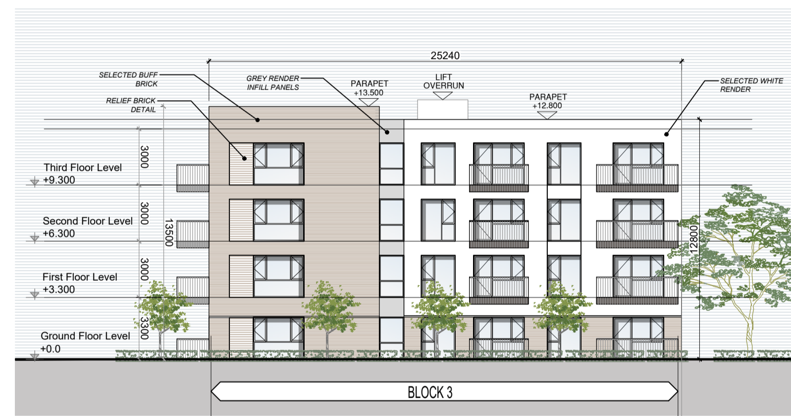
BLOCK 3 - SOUTH ELEVATION Scale 1:200@A1