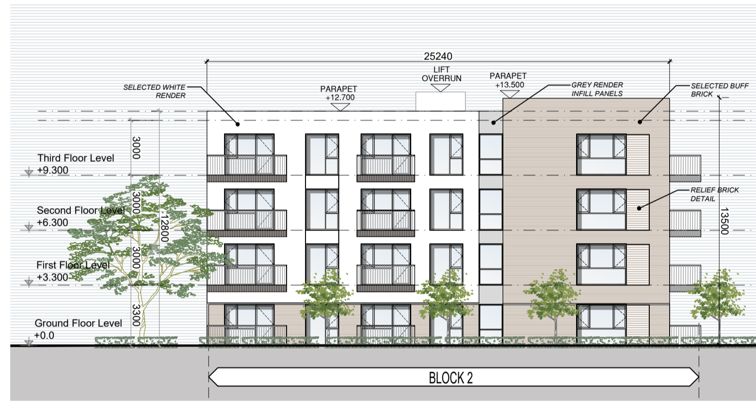
BLOCK 2 - SOUTH ELEVATION Scale 1:200@A1