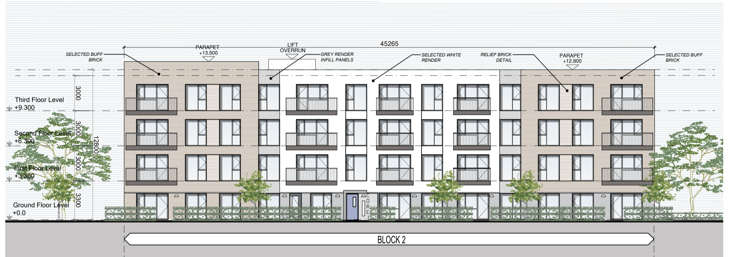
BLOCK 2 - EAST ELEVATION Scale 1:200@A1