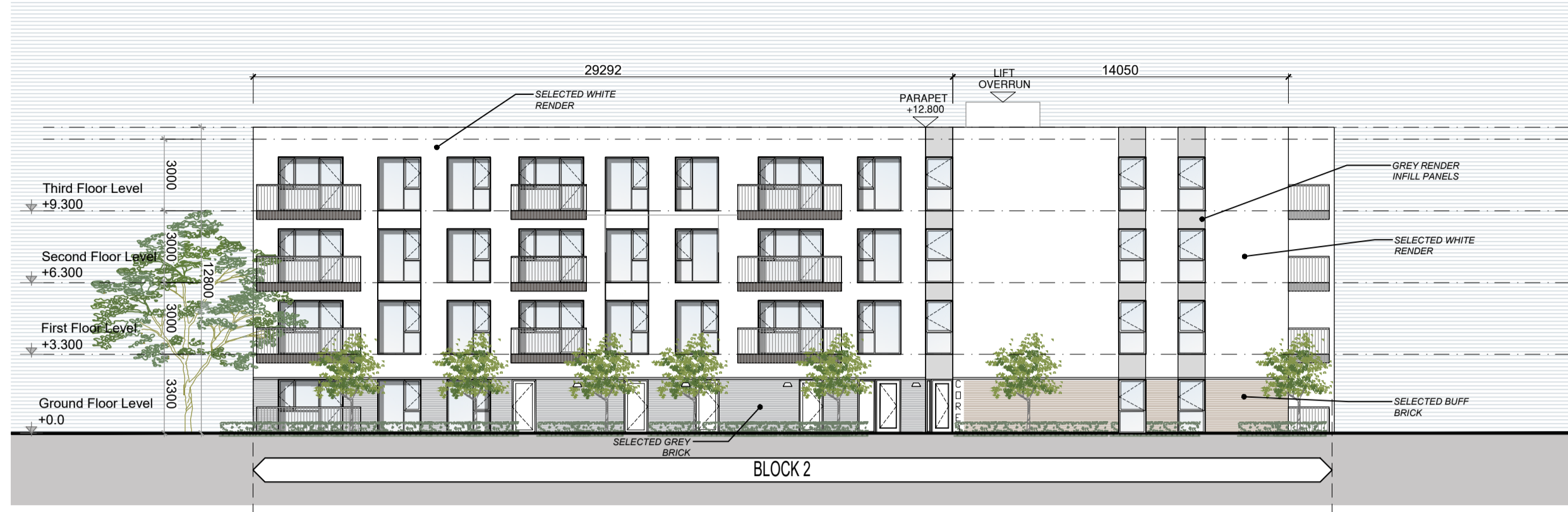
BLOCK 2 - WEST ELEVATION Scale 1:200@A1