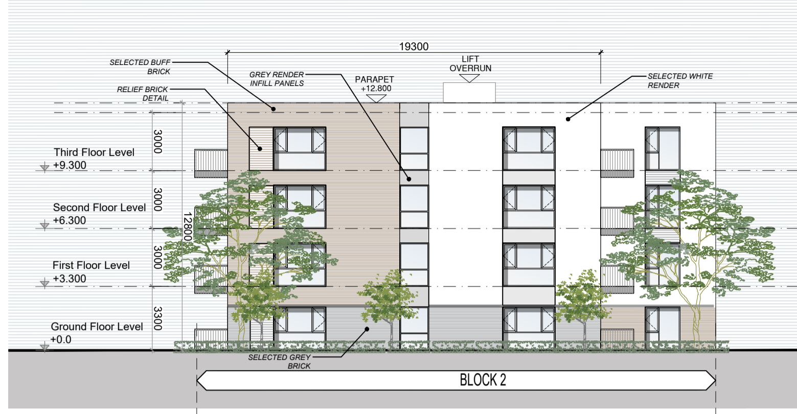
BLOCK 2 - NORTH ELEVATION Scale 1:200@A1