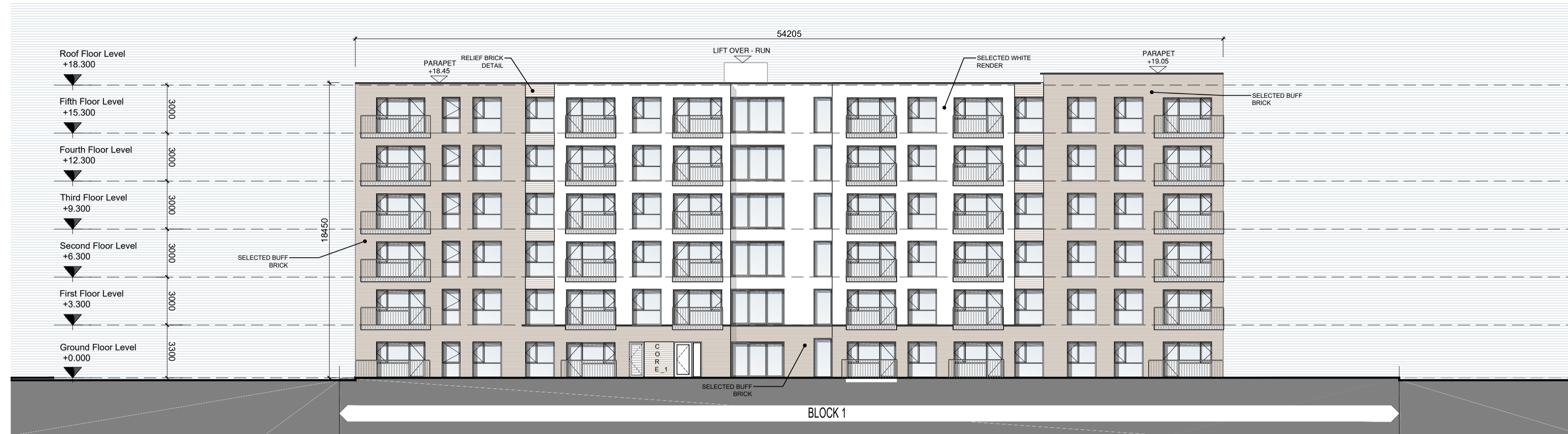
WEST ELEVATION SCALE 1:200 @ A1