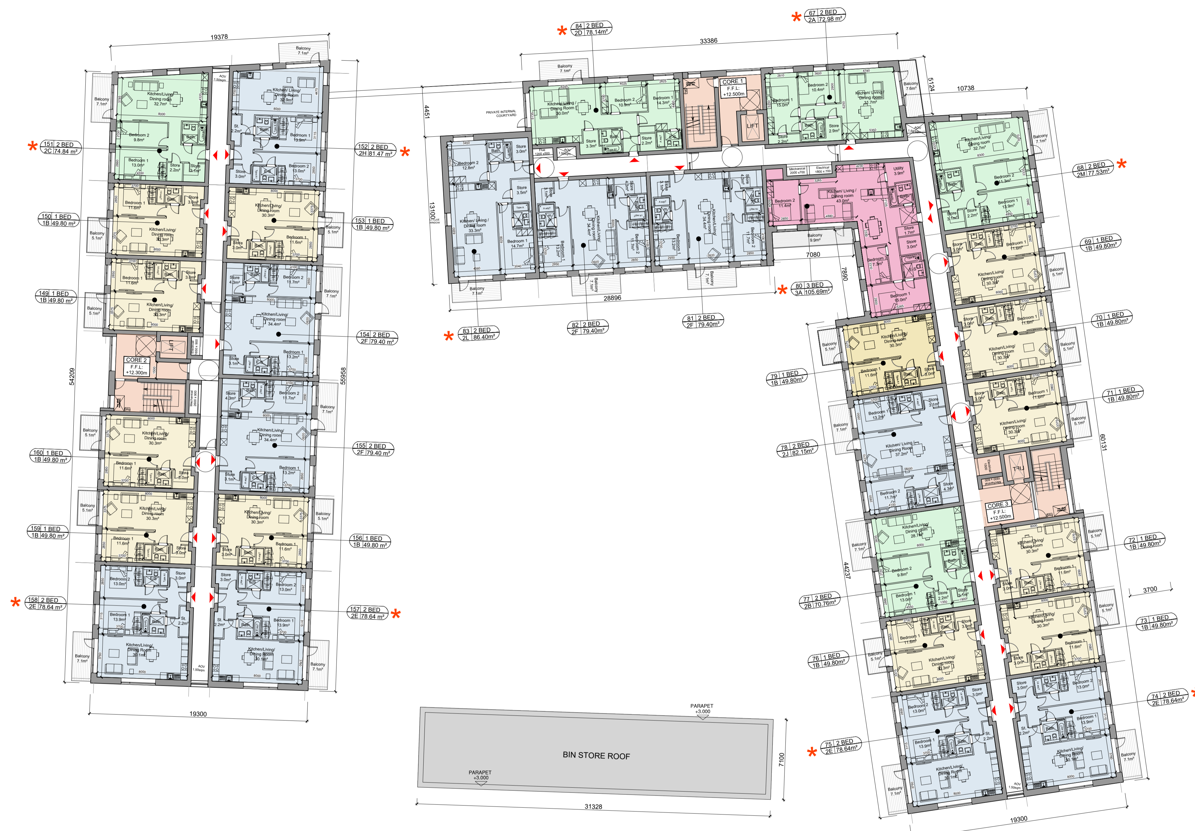
BLOCK 1 - FOURTH FLOOR PLAN 1:200@A1