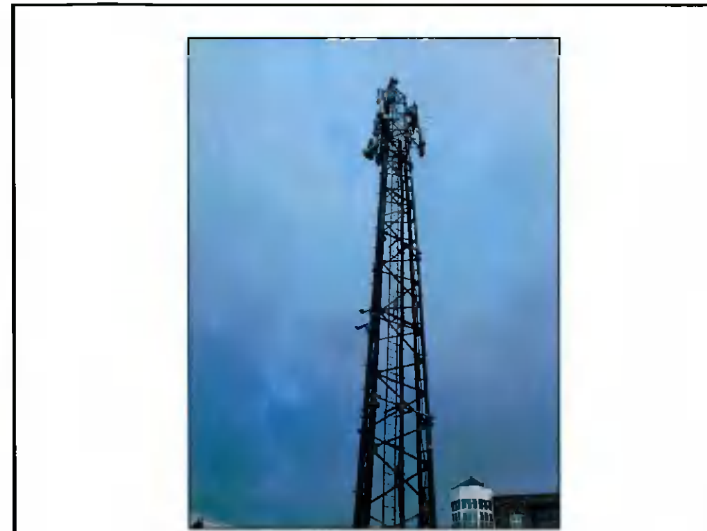
FIG 1. ELEVATION