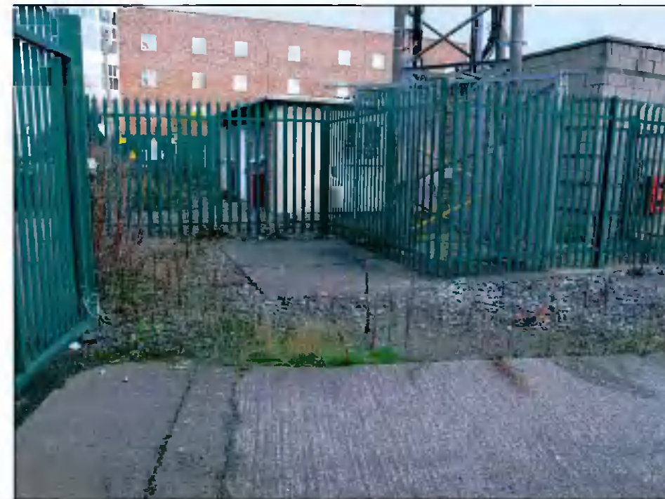
FIG 2. PROPOSED EQUIPMENT LOCATION

ALL DIMENSIONS ARE IN mm UNLESS NOTED OTHERWISE