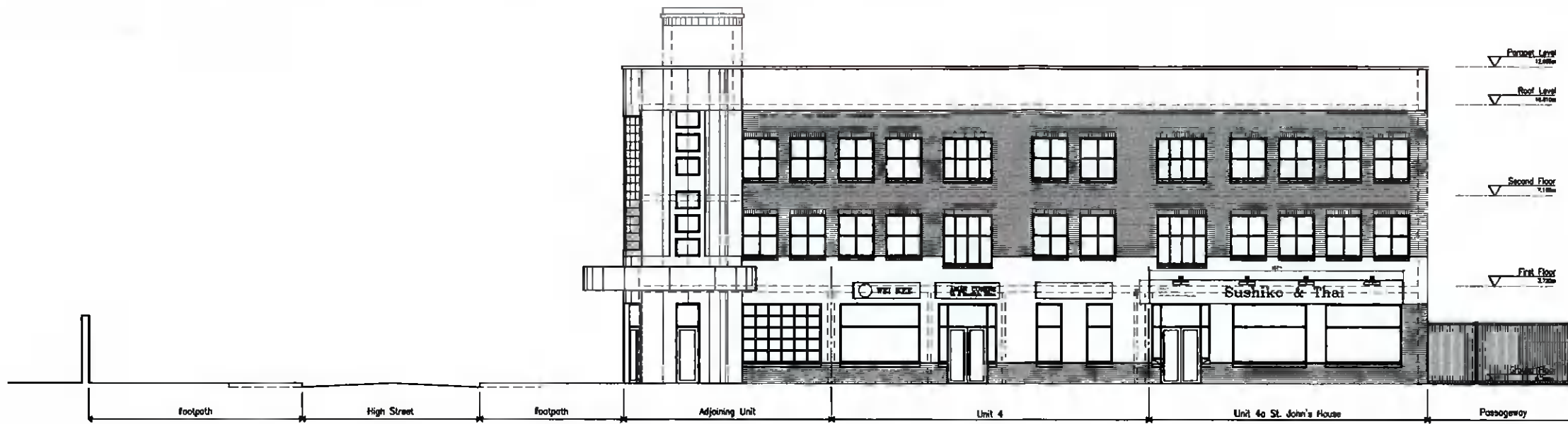
Contiguous Front/N.East Elevation SCALE: 1:200 @ A3

Notes: All drawings are the copyright of the consultants (NJA Planning Consultants) and may not be used in whole or in part without their expressed permission in writing. Do not scale from this drawing, use written dimensions only. All dimensions to be checked on site by the contractor and the consultant notified of any discrepancies. All levels indicated are approximate relative levels and do not relate to Ordnance Datum. All levels must be checked on site. All works to be carried out in accordance with the 1997 Building Regulations, with all subsequent revisions to same, and with the requirements of the relative Local Authority.