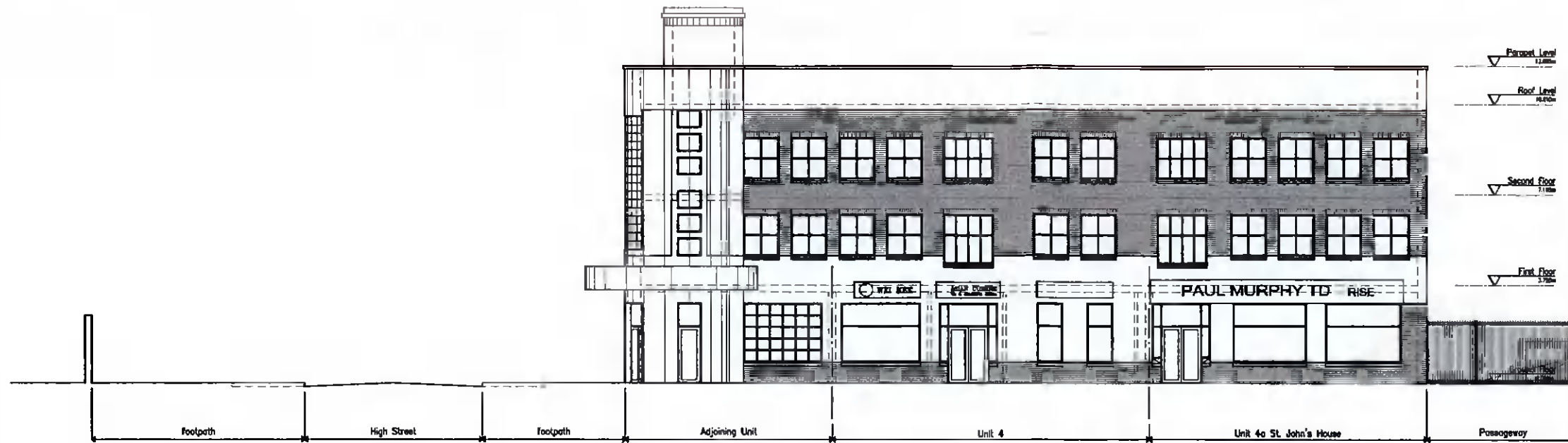
Contiguous Front/N.East Elevation SCALE: 1:200 @ A3

All drawings are the copyright of the consultant (NJA Planning Consultants) and may not be used in whole or in part without their expressed permission in writing. Do not scale from this drawing, use written dimensions only. All dimensions to be checked on site by the contractor and the consultant notified of any discrepancies. All levels indicated are approximate relative levels and do not relate to Ordnance Datum. All levels must be checked on site. All works to be carried out in accordance with the 1997 Building Regulations, with all subsequent revisions to same, and with the requirements of the relevant Local Authority.