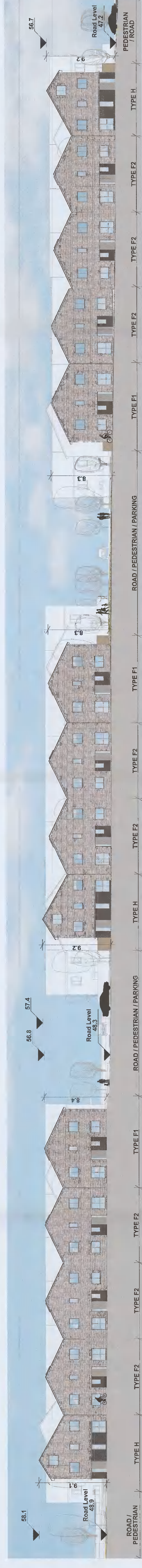
1:200 Section 3