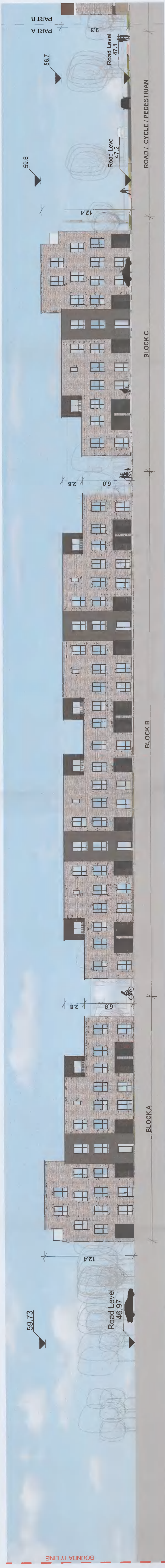
1:200 Section 1