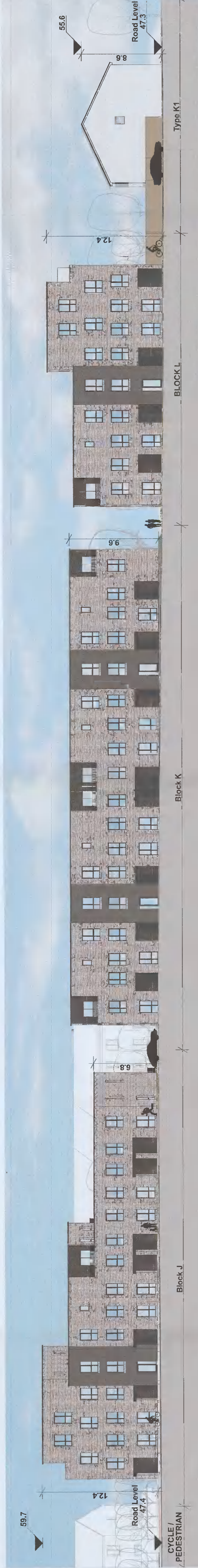
1:200 Section 2