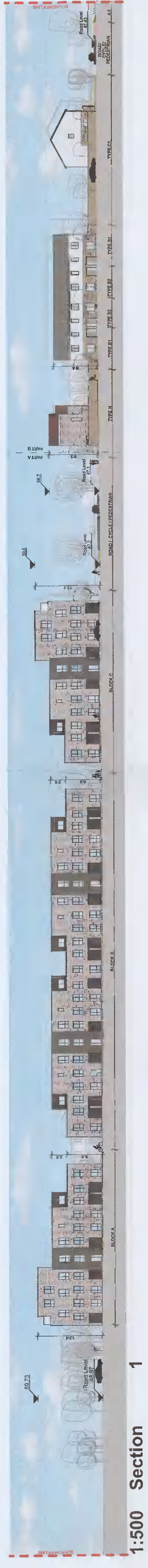
1:500 Section 1