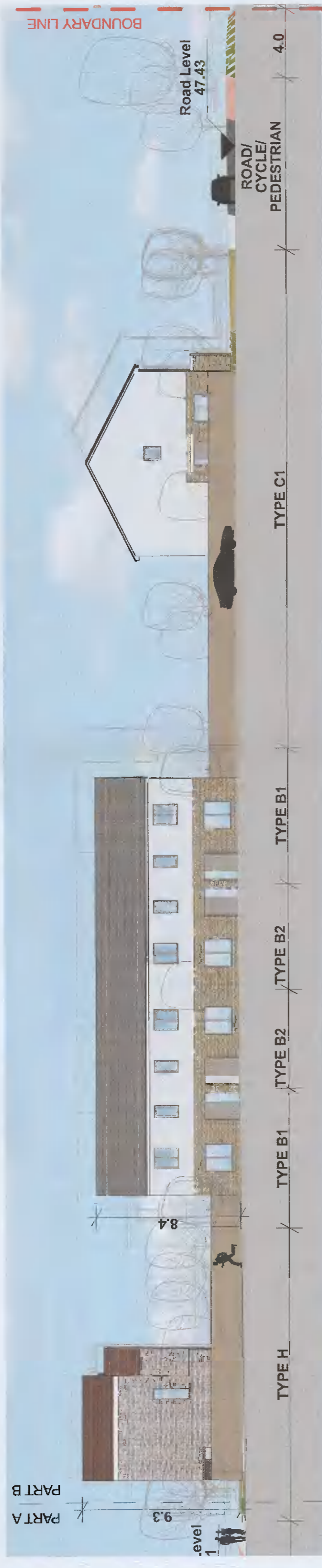
1:200 Section 1