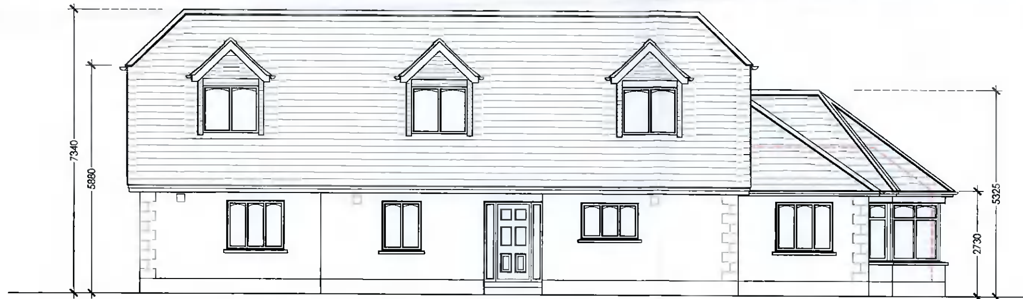
01 Existing Front Elevation (North)