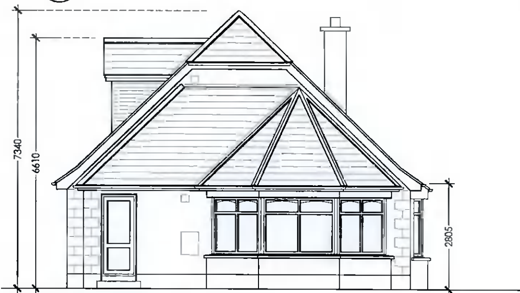
02 Existing Side Elevation (West)