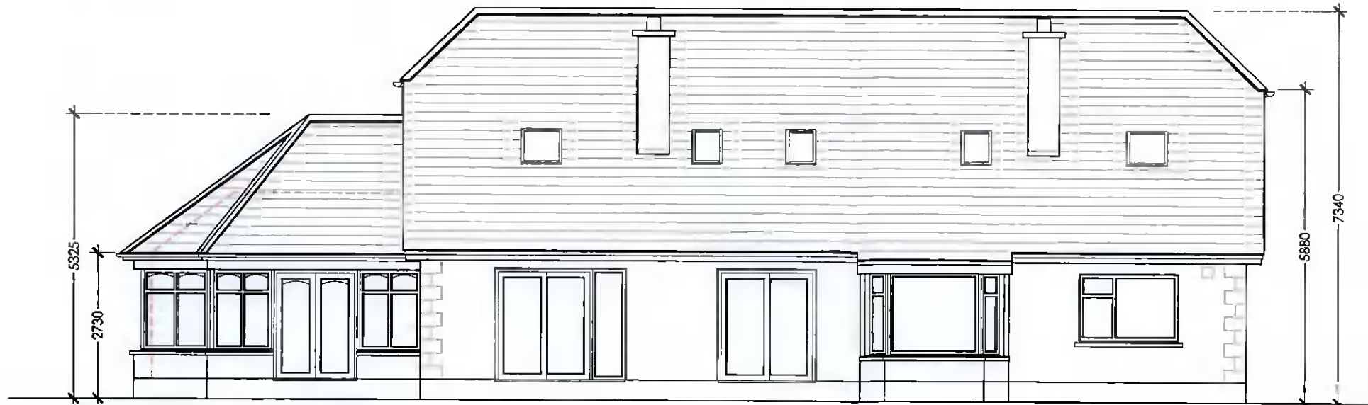
04 Existing Rear Elevation (South)