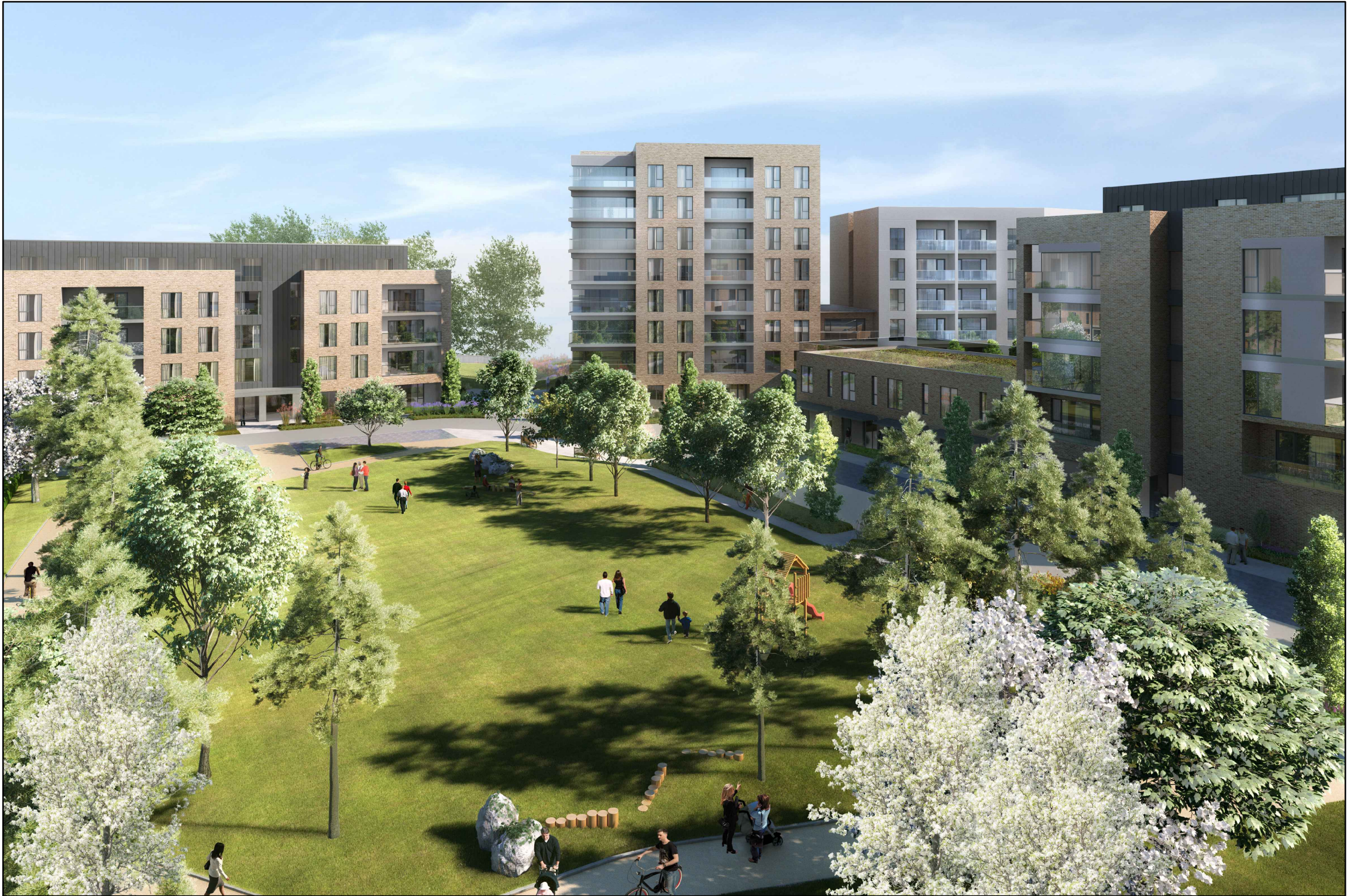
VIEW 1 OVERLOOKING THE PUBLIC OPEN SPACE