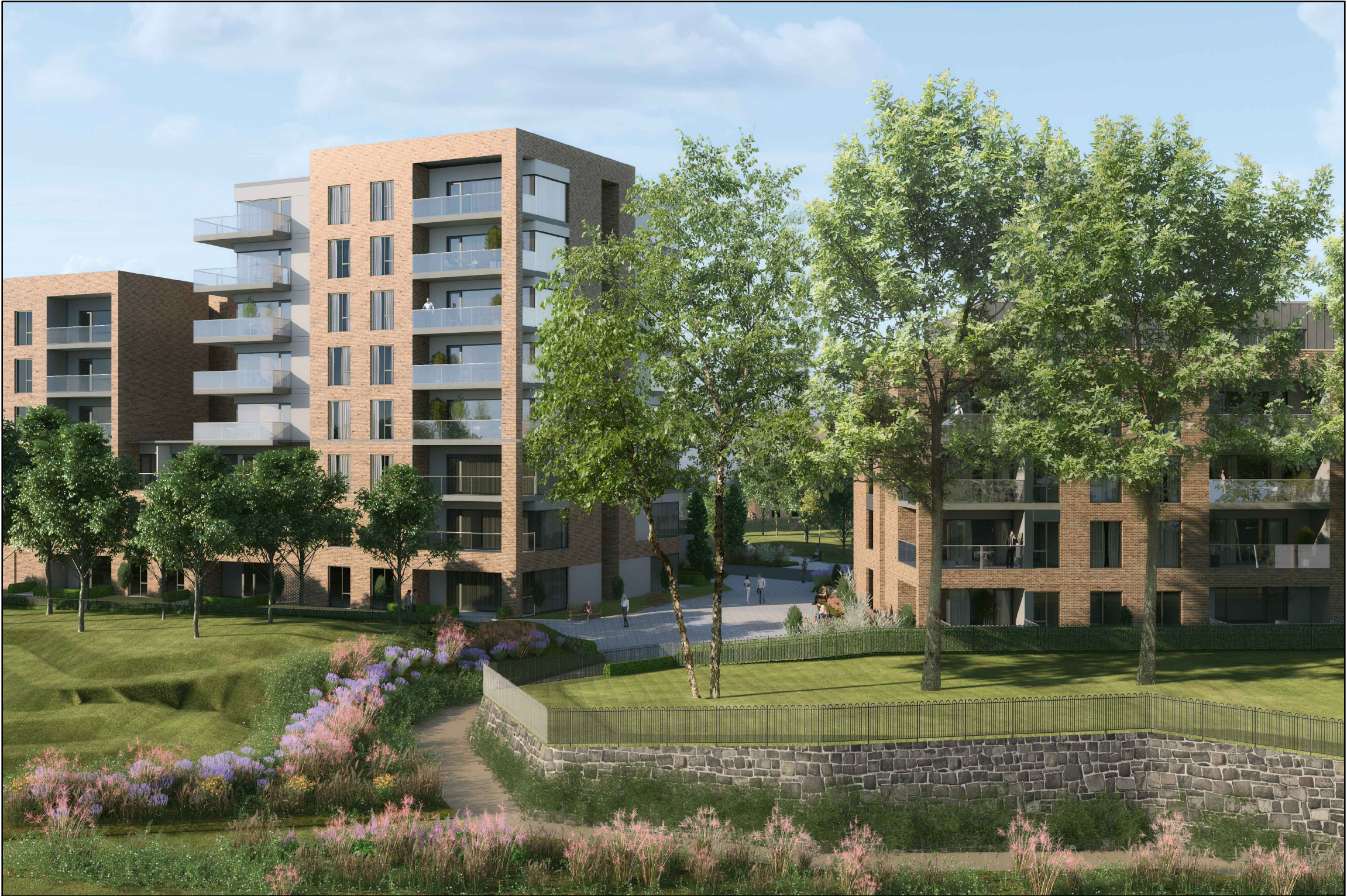
VIEW 2 VIEW FROM THE N4 SLIPWAY