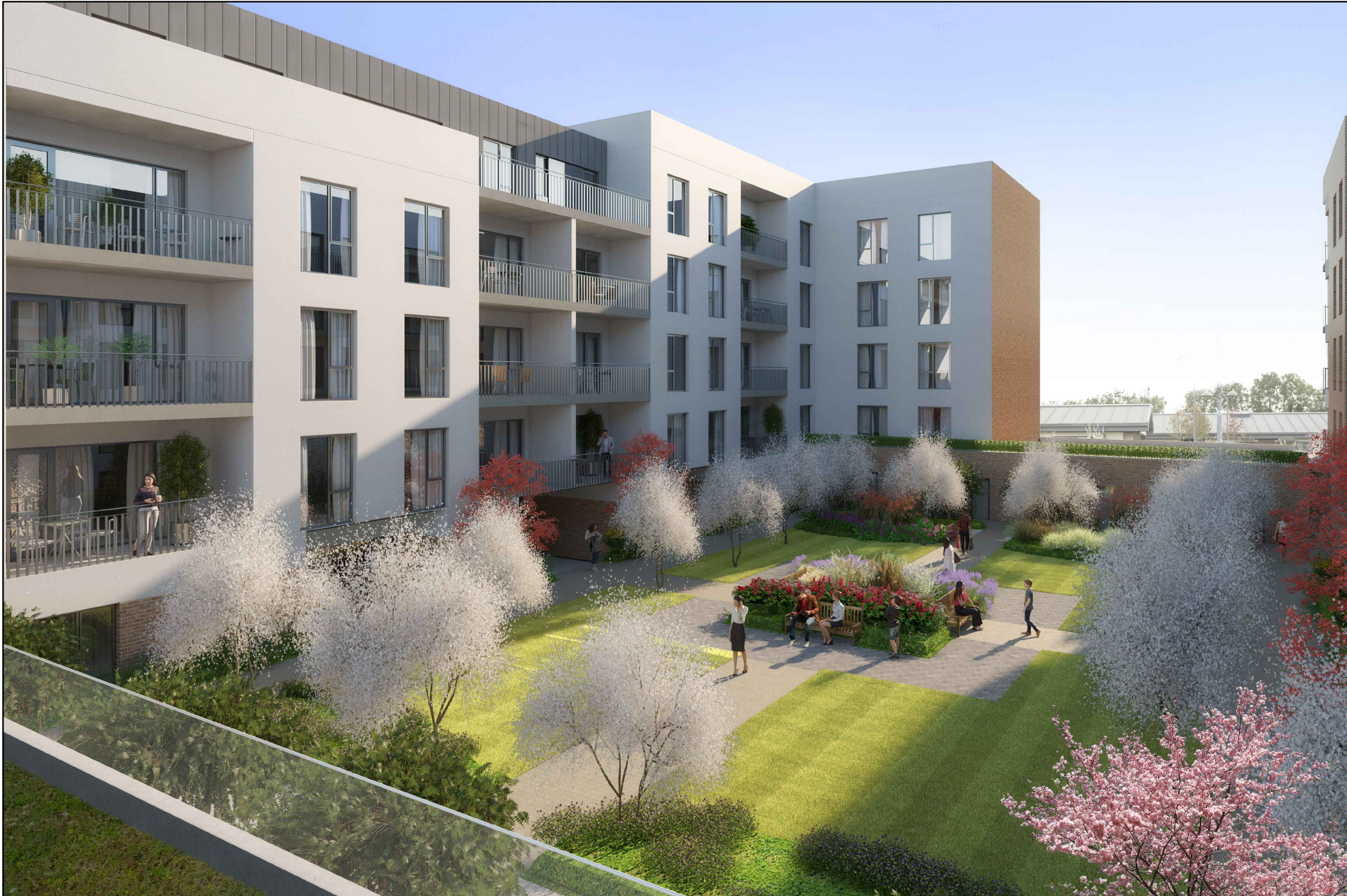
VIEW 3 VIEW OF COMMUNAL OPEN SPACE (COURTYARD) IN BLOCK 1