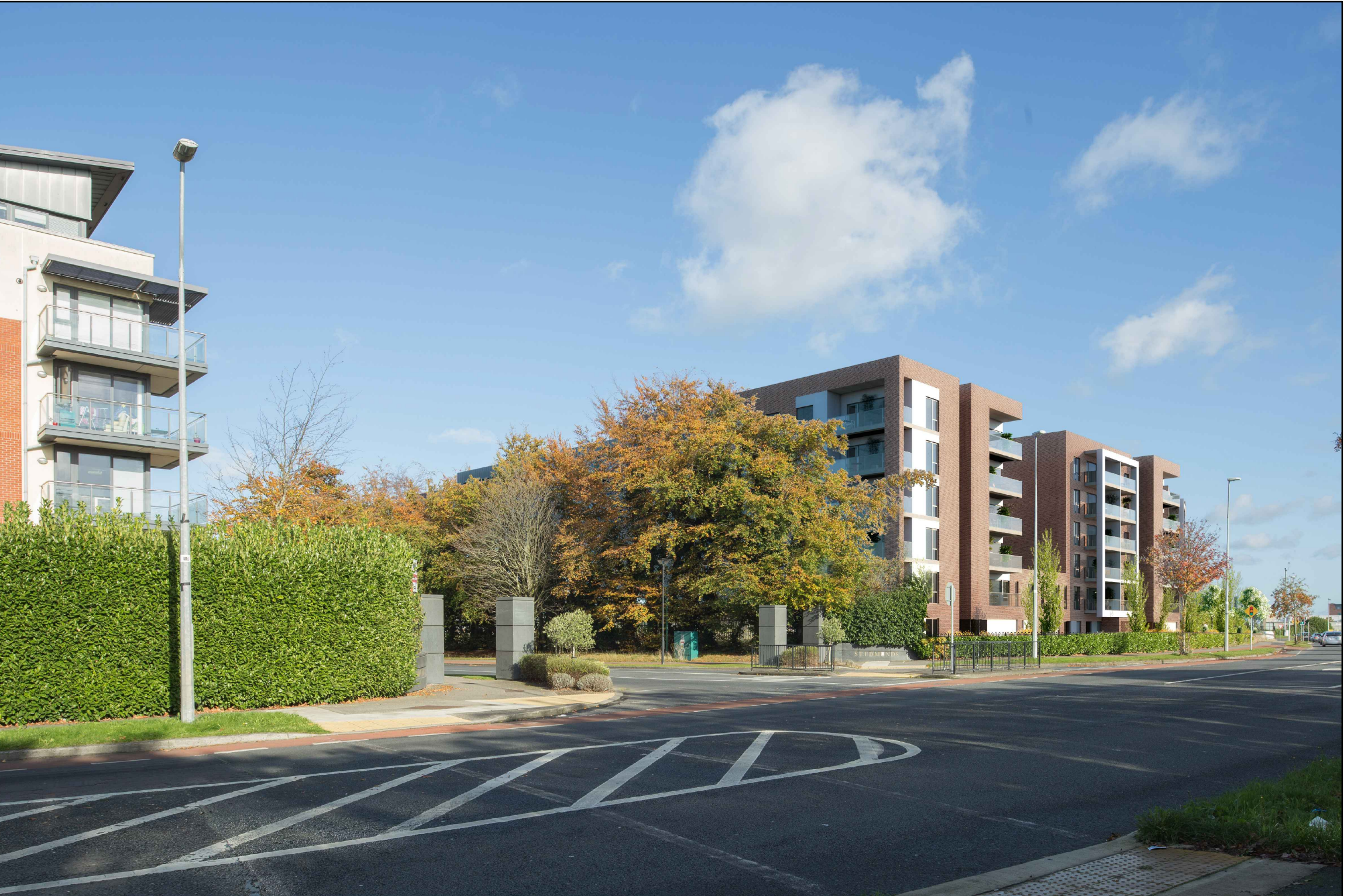
VIEW 4 VIEW OF BLOCK 1 AT ENTRANCE FROM ST. LOMANS ROAD