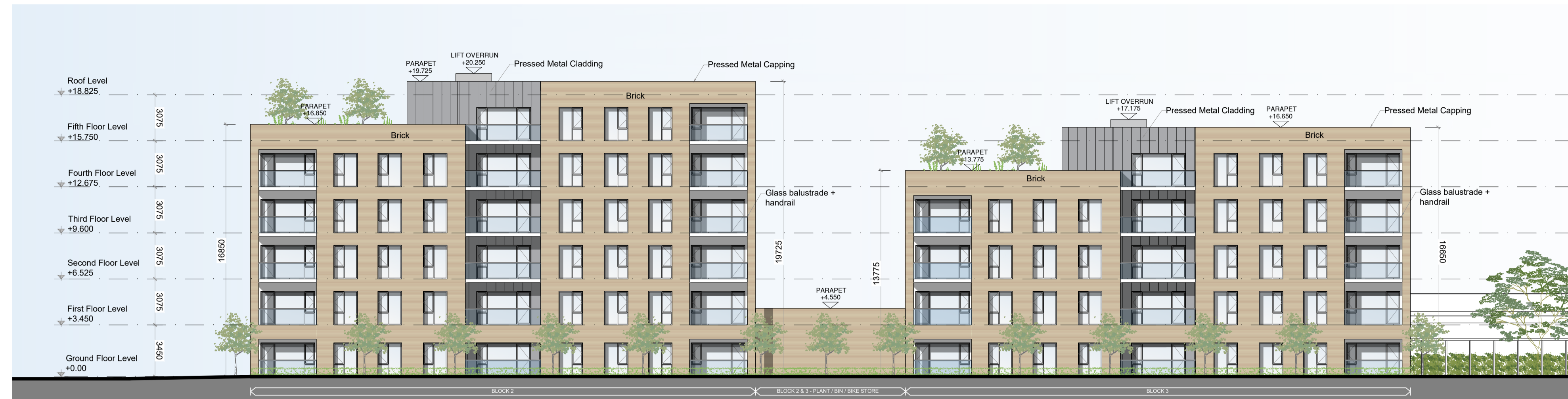
01 - EAST ELEVATION