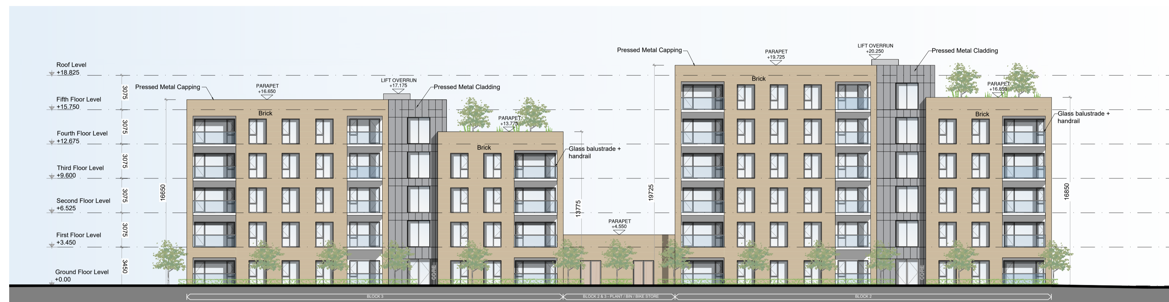
02- WEST ELEVATION