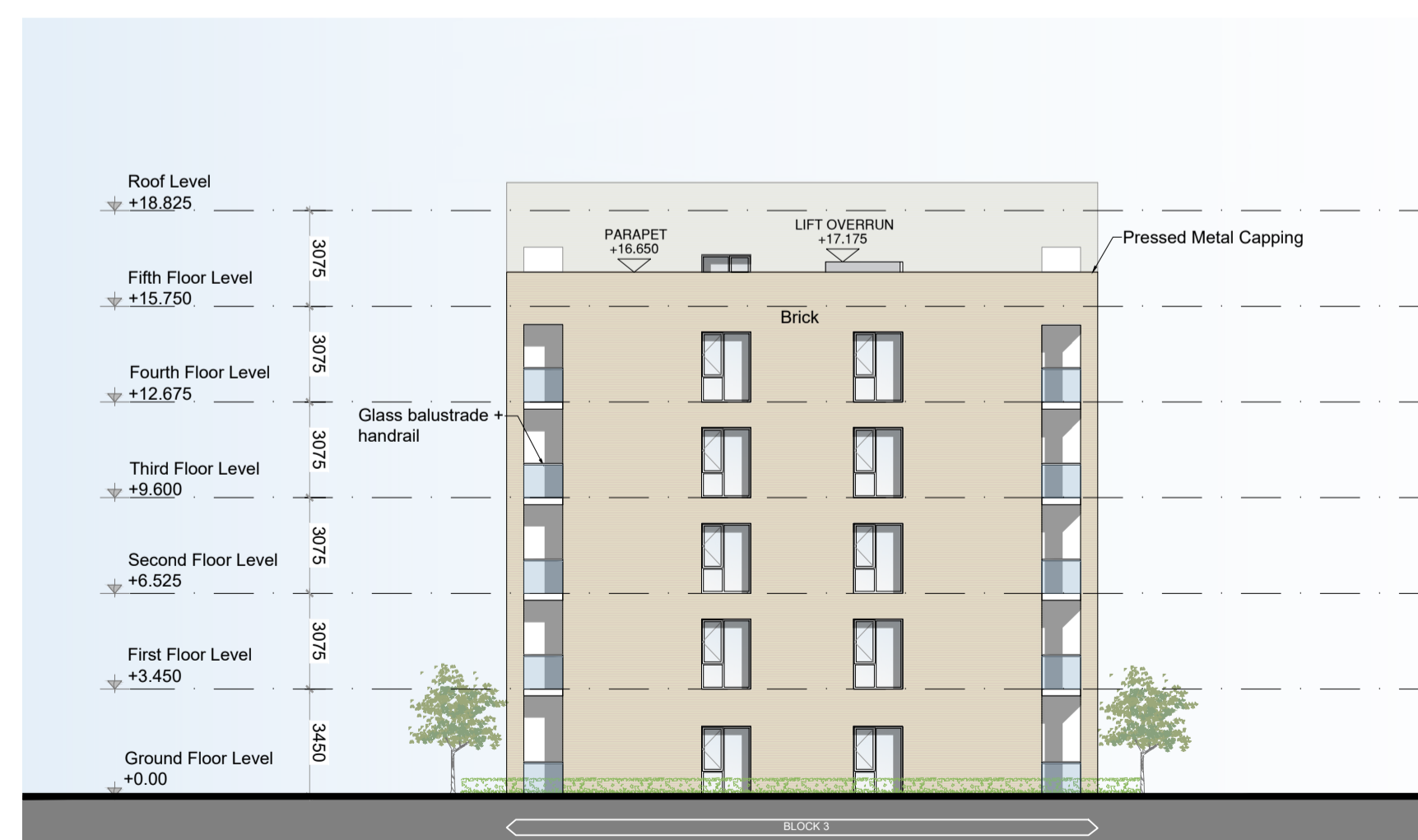
04- NORTH ELEVATION