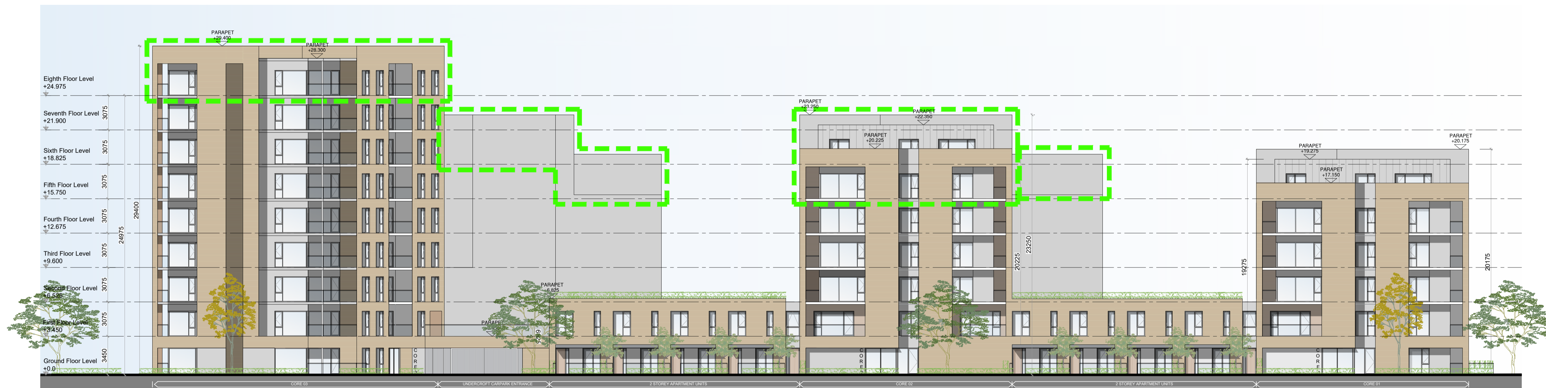
04- NORTH ELEVATION