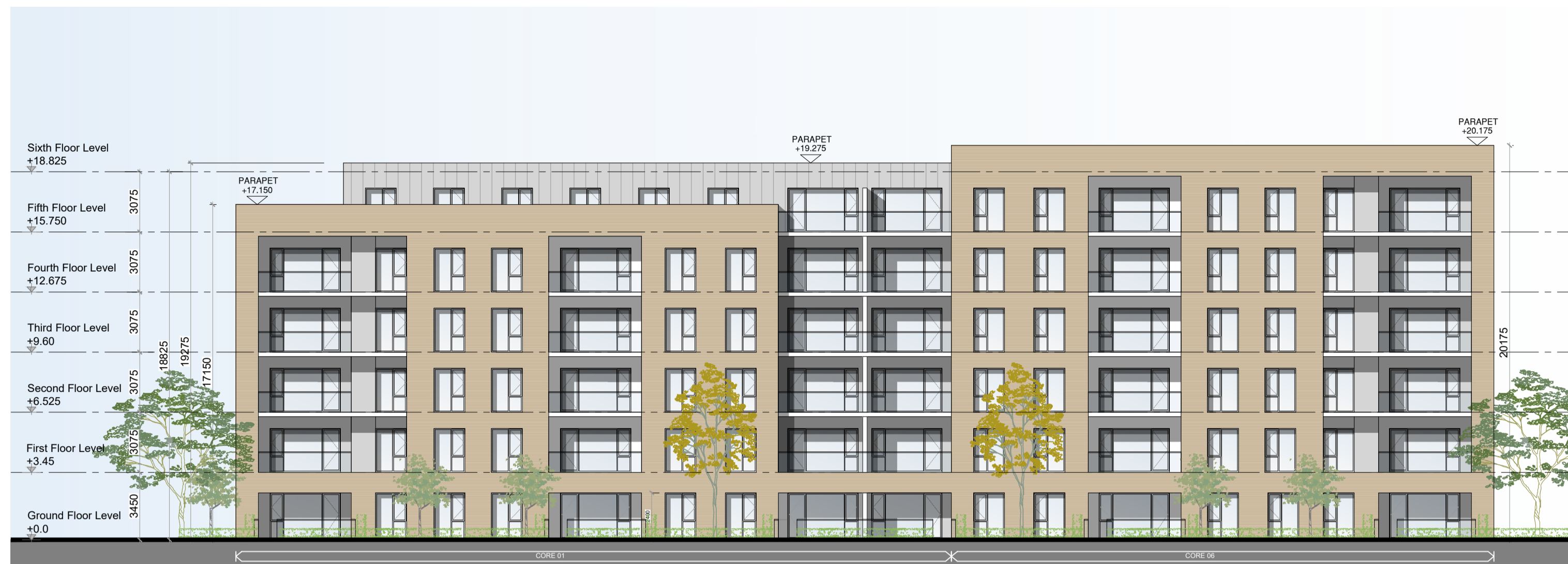
03- WEST ELEVATION