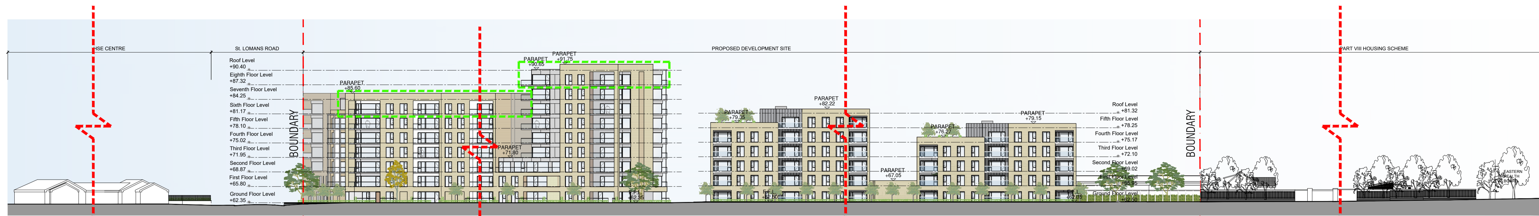
3- ELEVATION ALONG N4 SLIP ROAD SCALE 1:500