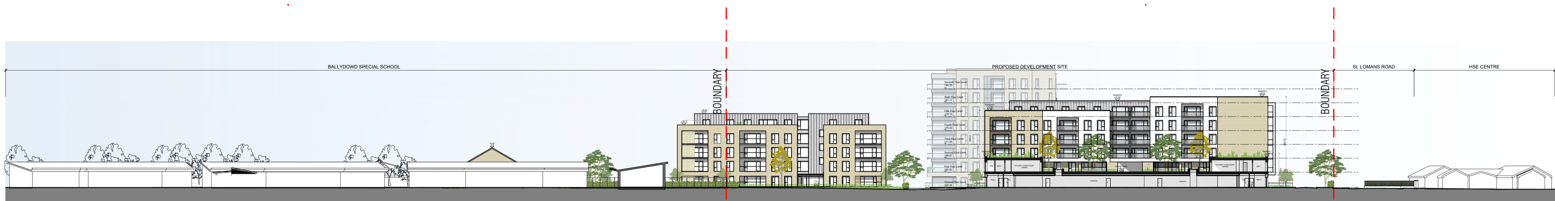
2- SECTION THROUGH SITE SCALE 1:500