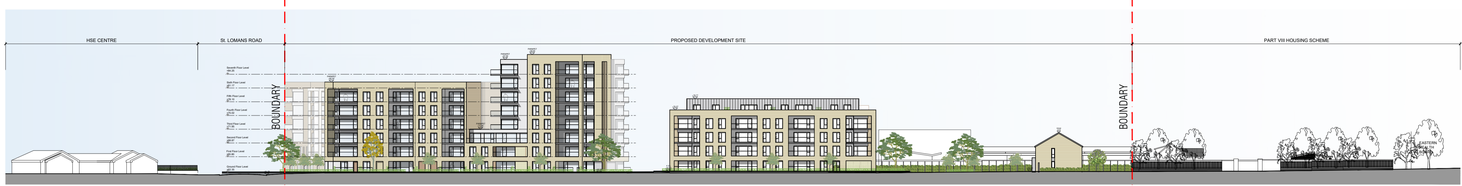
3- ELEVATION ALONG N4 SLIP ROAD SCALE 1:500