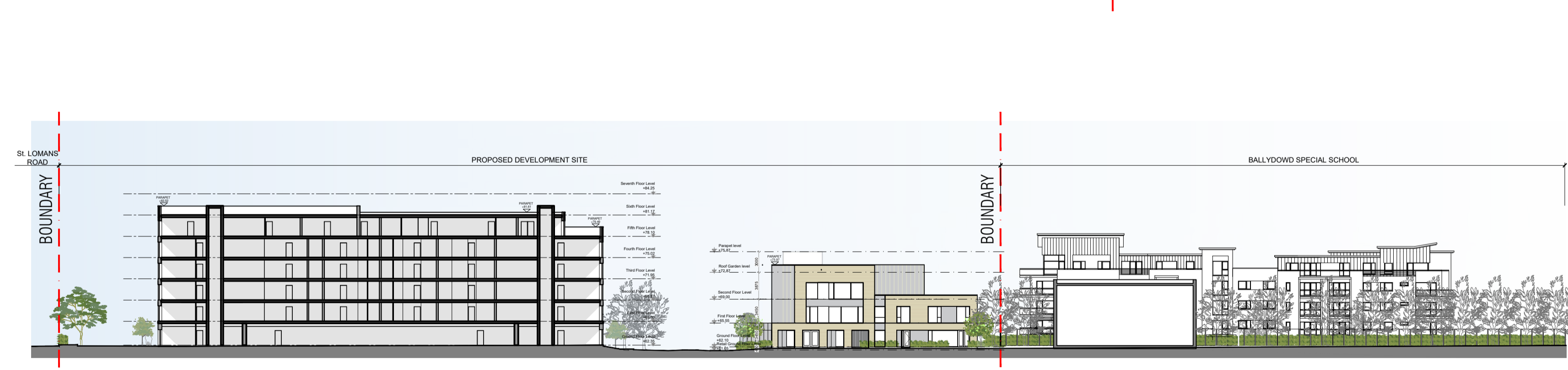
4-SECTION THROUGH SITE SCALE 1:500