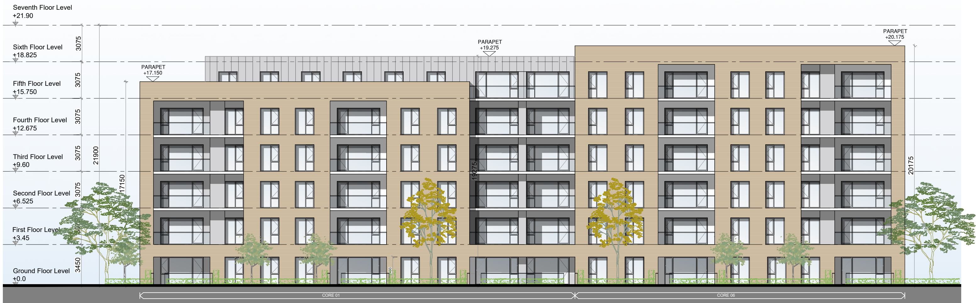
03- WEST ELEVATION