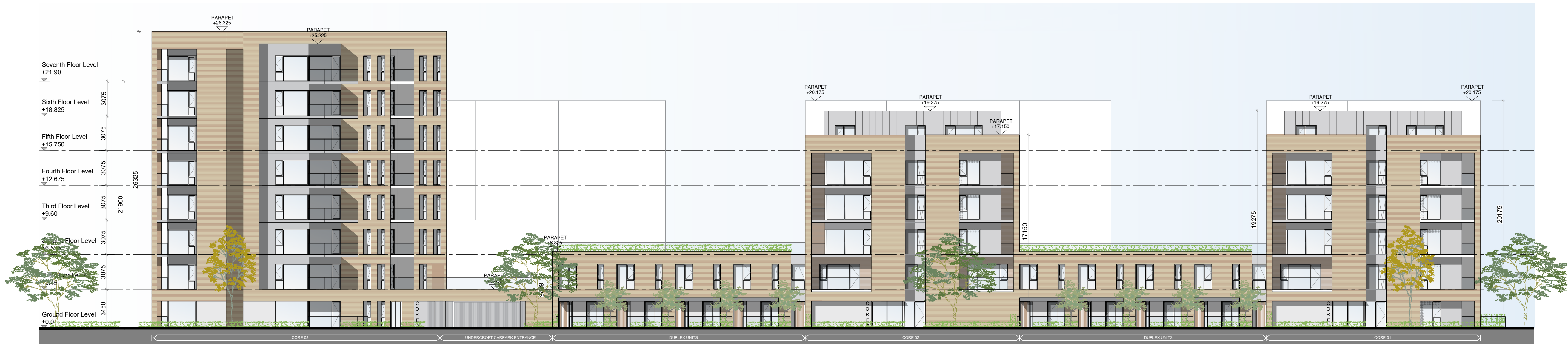
04- NORTH ELEVATION