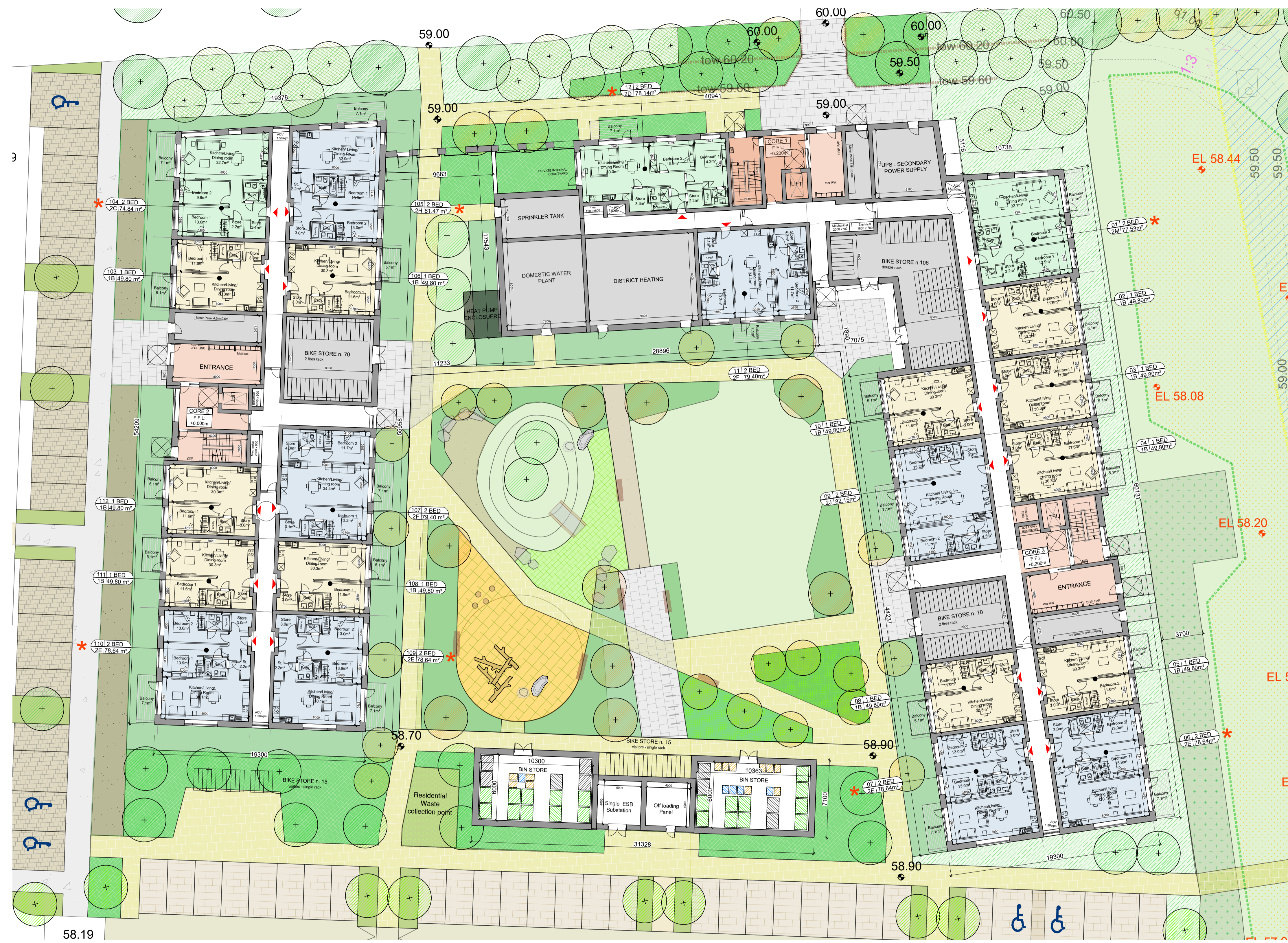
BLOCK 1 - GROUND FLOOR PLAN 1:200@A1

NOTES: DO NOT SCALE FROM DRAWINGS. WORK TO FIGURED DIMENSIONS ONLY. ARCHITECT TO BE NOTIFIED OF ALL DISCREPANCIES.