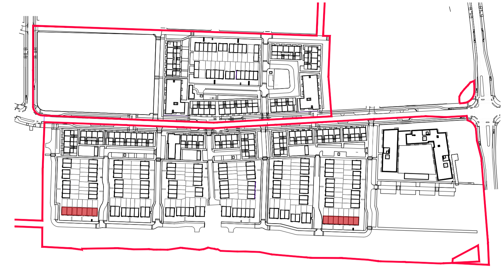
KEY PLAN - NTS

* SOLAR PANELS: INDICATIVE SOLAR PANEL POSITION. FINAL SOLAR PANEL POSITION DEPENDS ON HOUSE ORIENTATION. THE SOLAR PANELS SHOWN ARE A PROVISIONAL OPTION TO SATISFY RENEWABLE ENERGY REQUIREMENTS OF BUILDING REGS PART L. SOLAR PANELS MAY BE OMITTED IN FAVOUR OF ALTERNATIVE RENEWABLE ENERGY SOURCE.