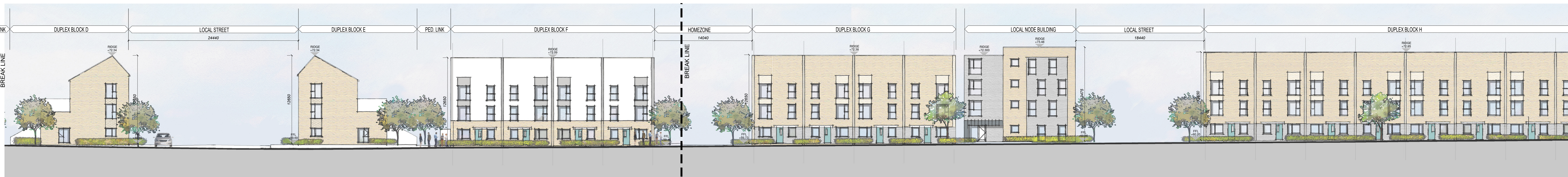
02 SECTION A - A (cont.) SCALE 1:200 @ A0