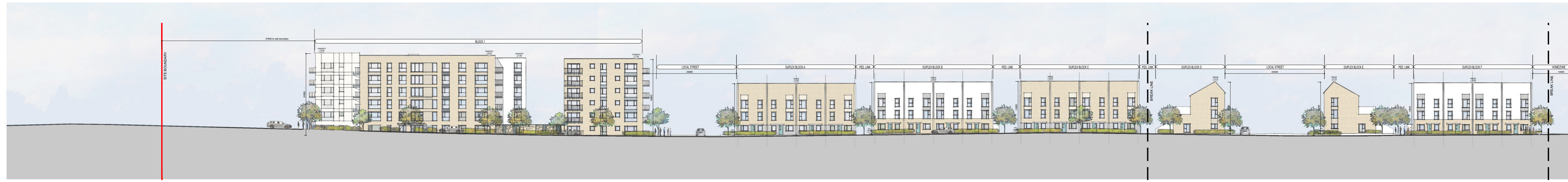
01 SECTION A - A SCALE 1:500 @ A0