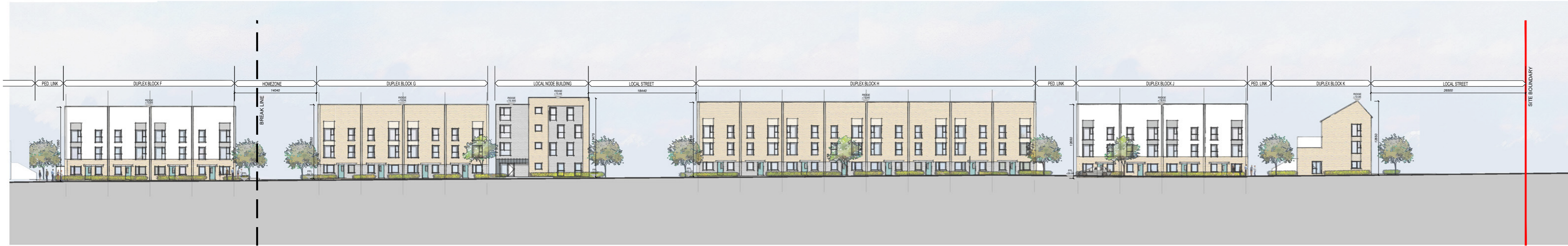
01 SECTION A - A (cont.) SCALE 1:500 @ A0