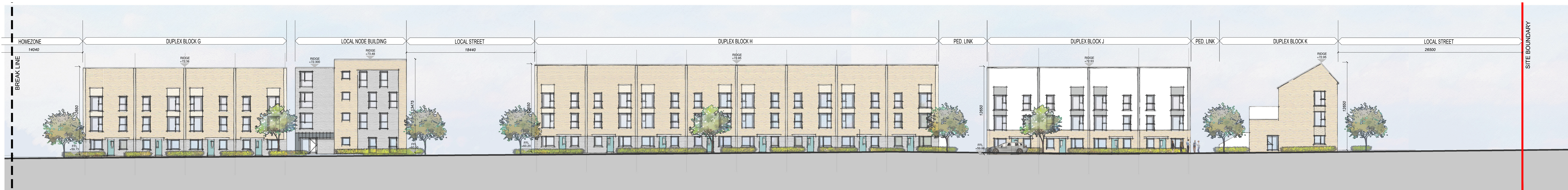
02 SECTION A - A (cont.) SCALE 1:200 @ A0