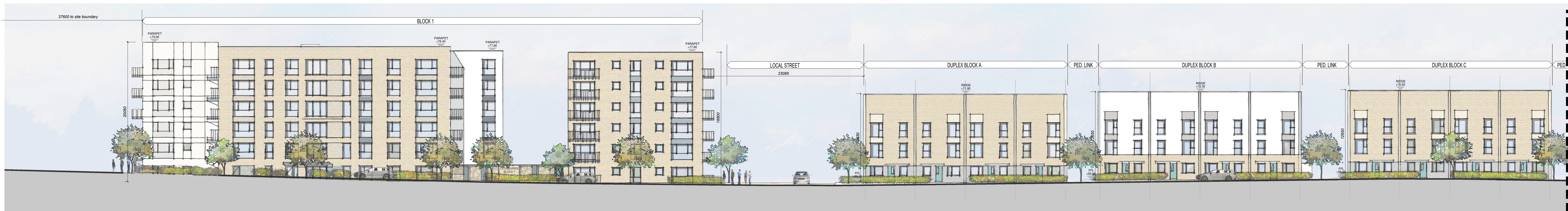
02 SECTION A - A SCALE 1:200 @ A0