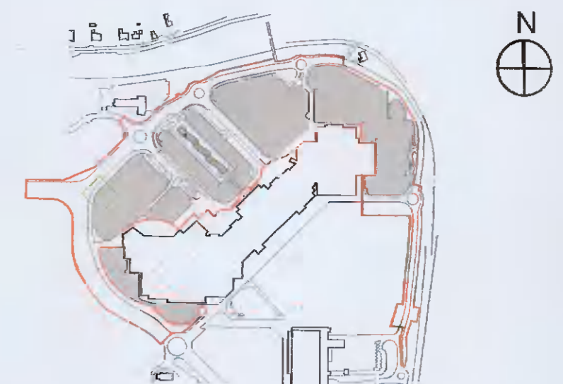
SITE KEYPLAN NOT TO SCALE

ALL DIMENSIONS TO BE CHECKED ON SITE NO DIMENSIONS TO BE SCALED FROM THIS DRAWING DRAWING IS TO BE READ IN CONJUNCTION WITH RELEVANT CONSULTANT'S DRAWINGS