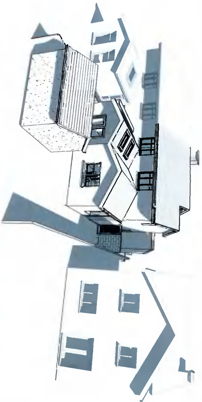
1 3D Perspective Existing