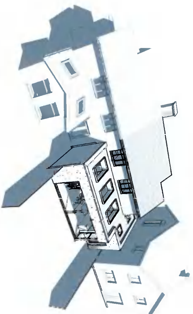
4 3D Perspective Proposed 02