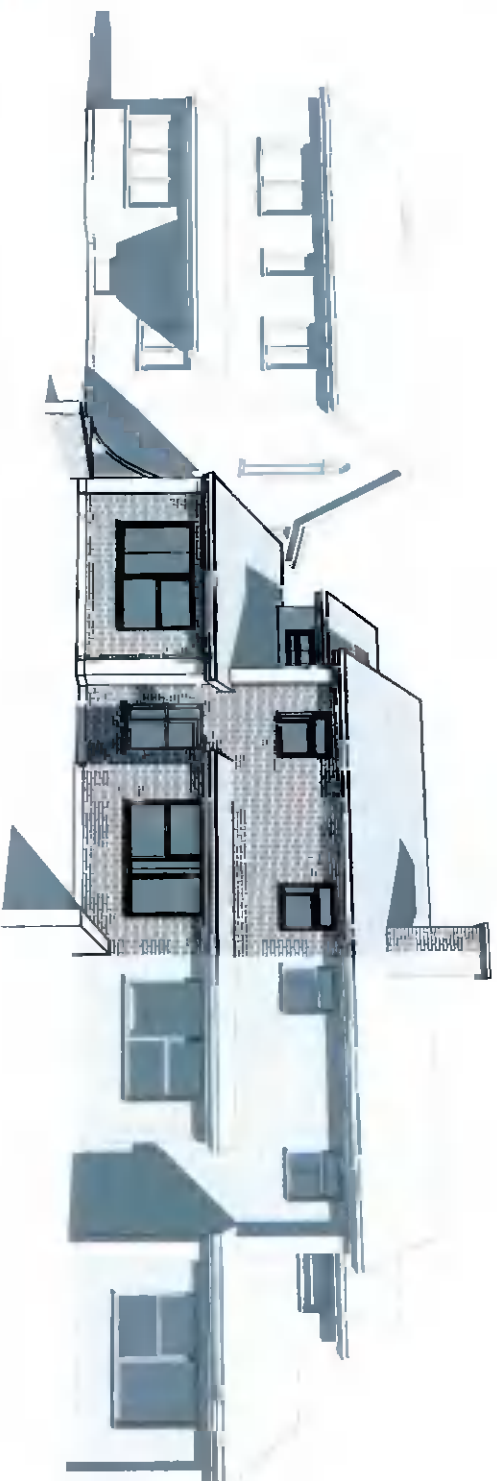
3 3D View 1