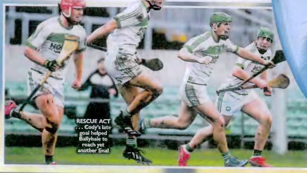
RESCUE ACT ... Cody's late goal helped Ballyhale to reach yet another final

Last Friday we were actually training so I came home to a load of congratulations