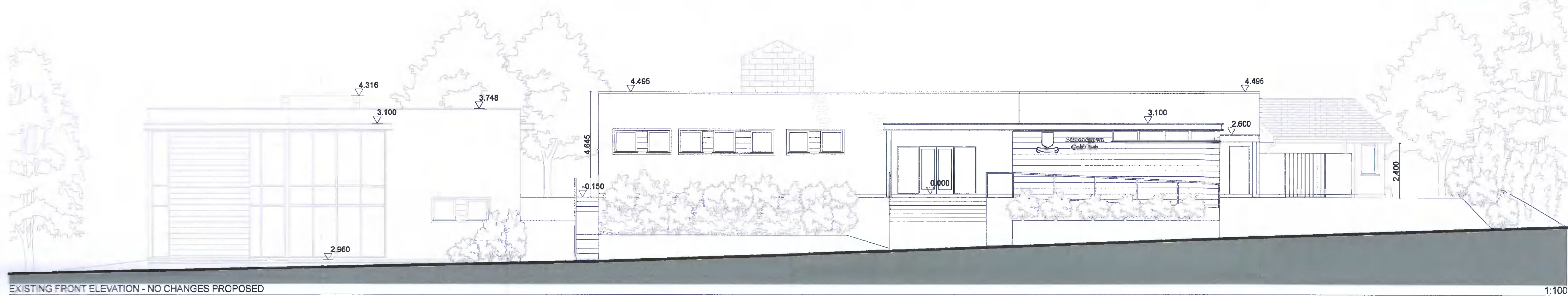
EXISTING FRONT ELEVATION - NO CHANGES PROPOSED