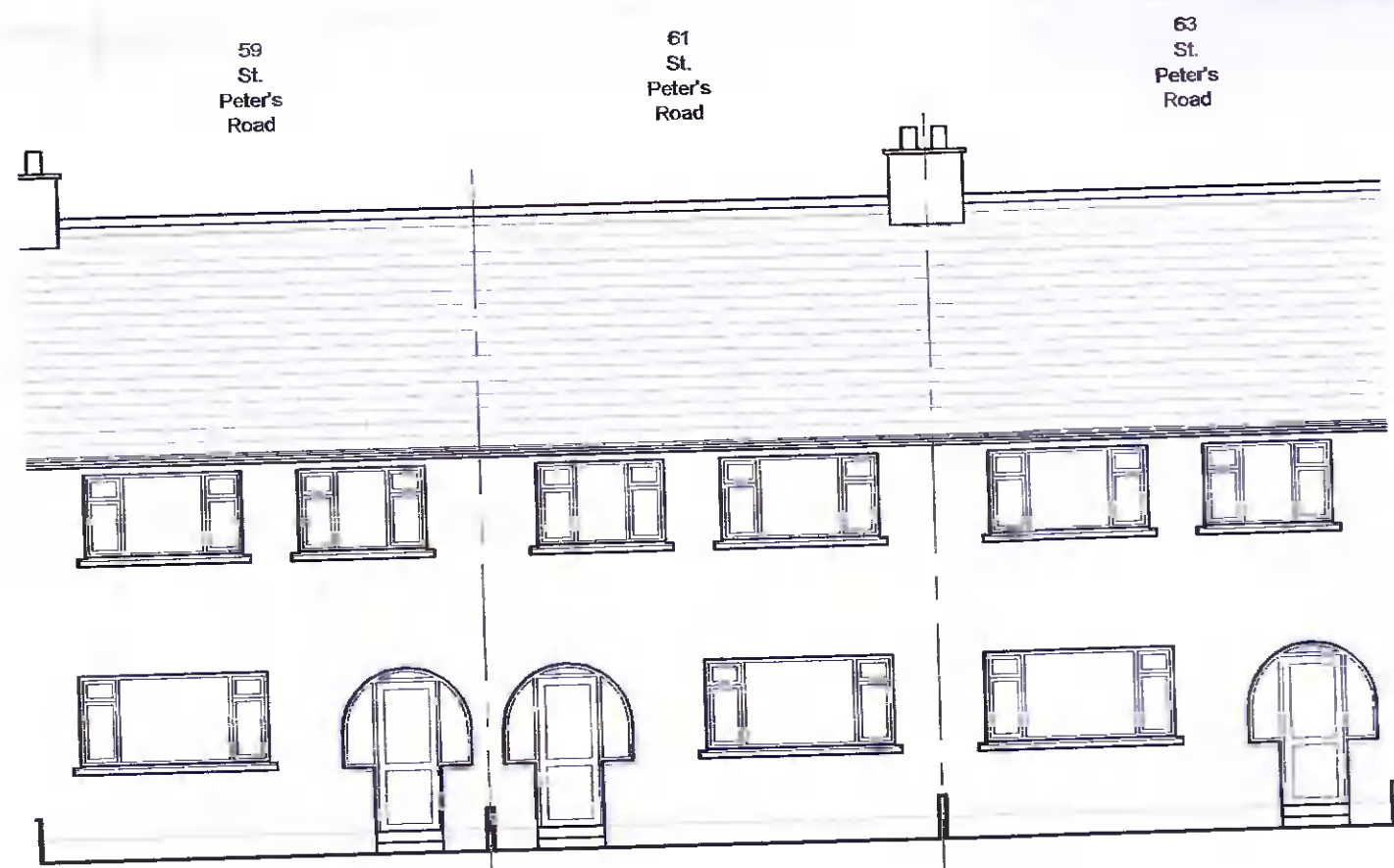
FRONT ELEVATION Scale: 1/100