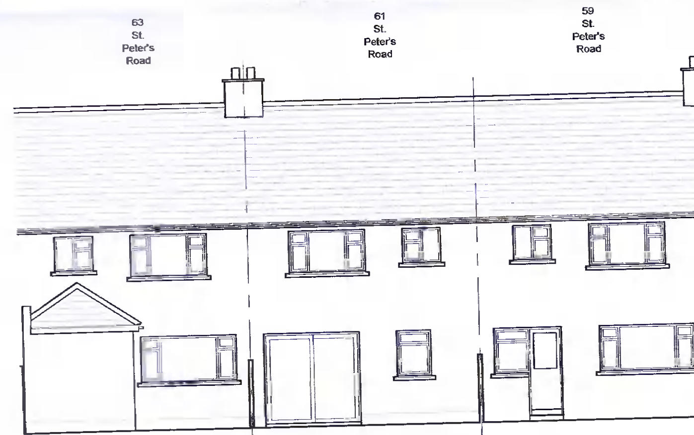
REAR ELEVATION Scale: 1/100

Pat O'Brien FRIAI Architect, 19 Cadogan Road, Fairview, Dublin 3, Tel: 018339337 Job / Client: 61 St. Peter's Road, Walkinstown / Finn Mason Drawing: Survey of Existing Scale: 1 / 100 Date: December 2021 Drg. No.: 2121 / PD02