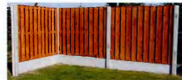
PHOTOGRAPH OF PROPOSED BOUNDARY FENCE