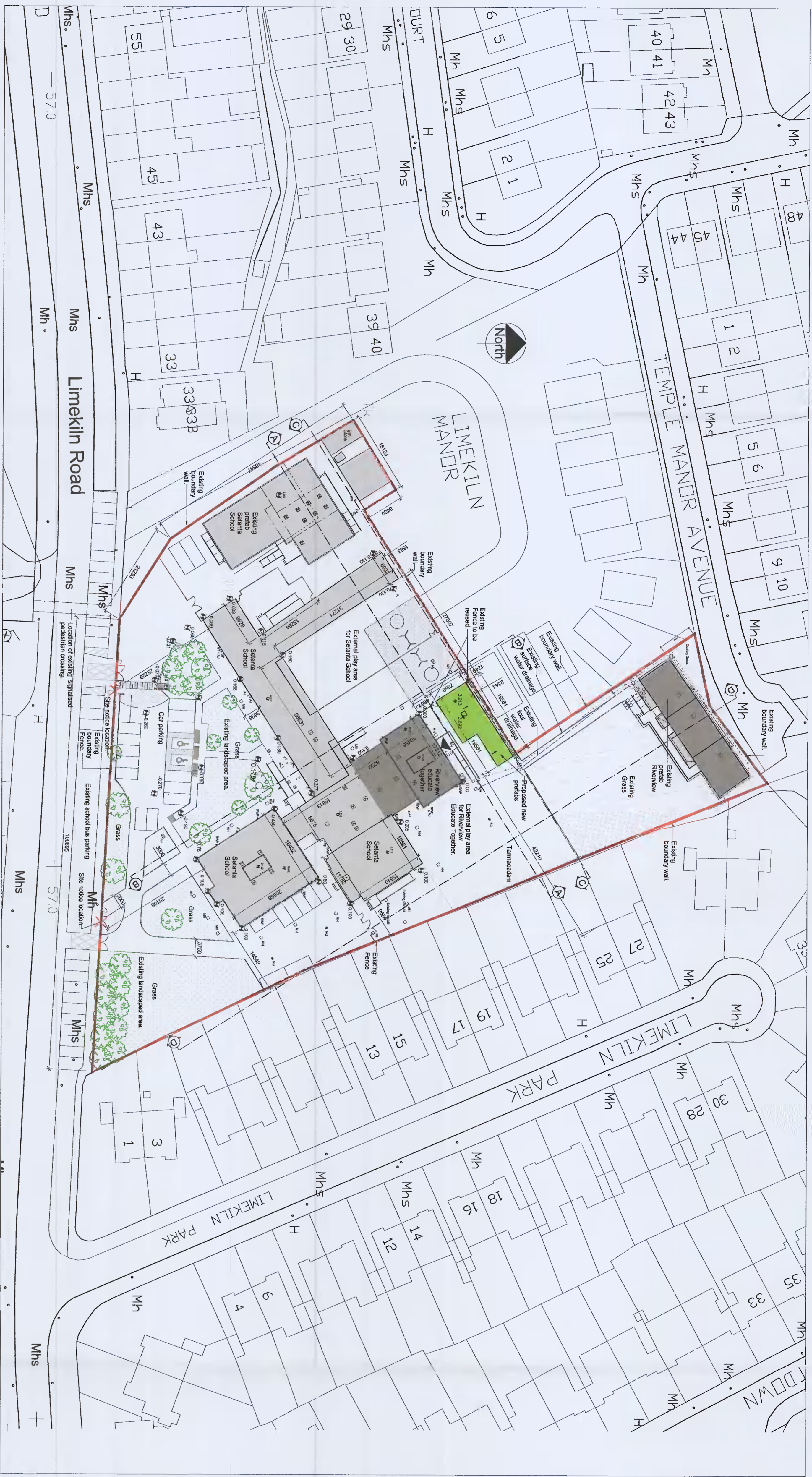
Site Plan Scale 1:500

DO NOT SCALE from this drawing. Only figured dimensions are to be used. This drawing is the copyright of MOLONEY O'BEIRNE. Any discrepancies between the drawing and other information shall be reported to the architect. Construction should ONLY proceed from drawings issued under working drawings for construction status, unless other written consent is given. Should any site personnel, or those employed to carry out works on their behalf, choose alternative materials or components to those specified by the drawings, they do so entirely at their own risk.