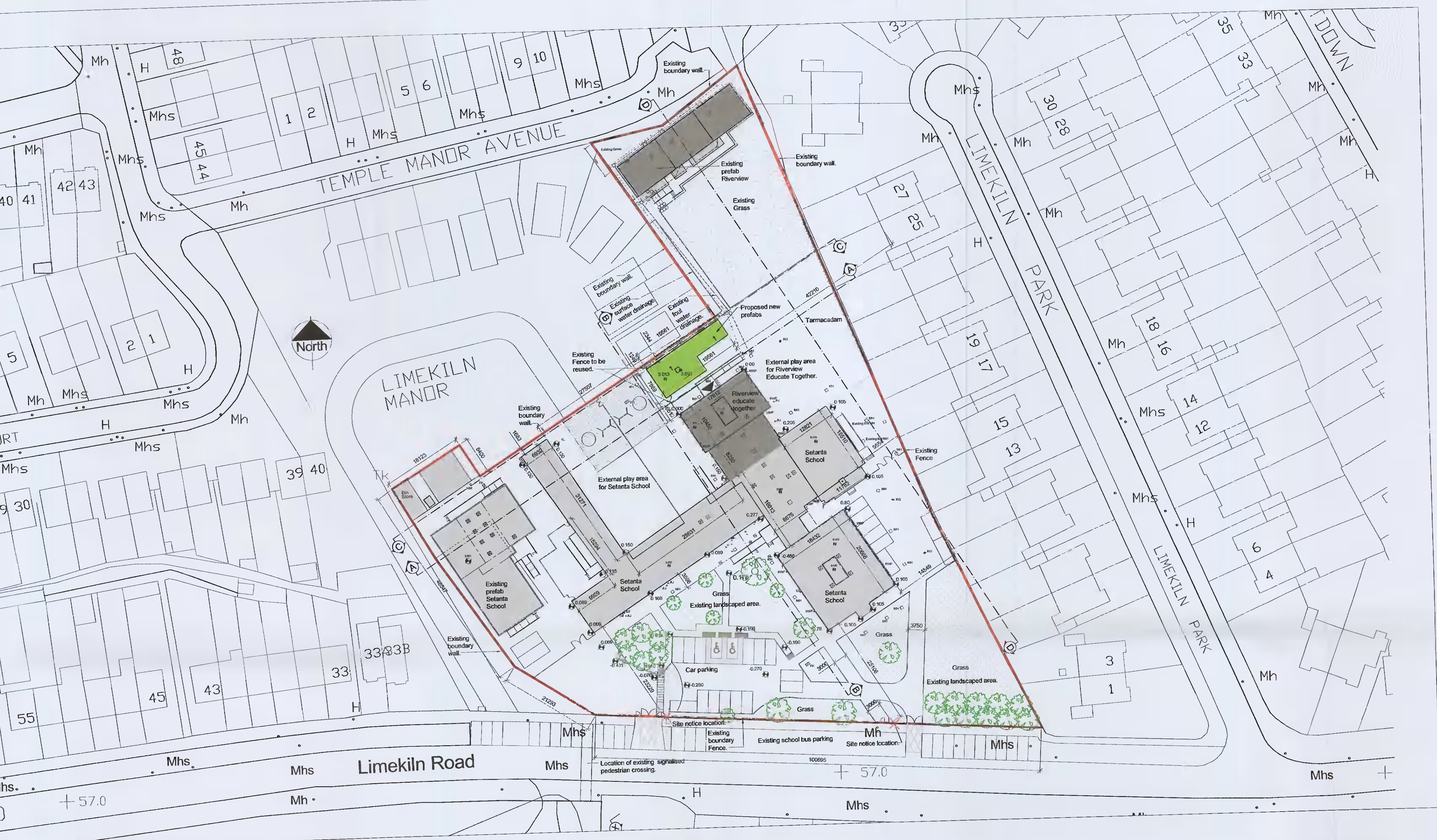
Site Plan Scale 1:500