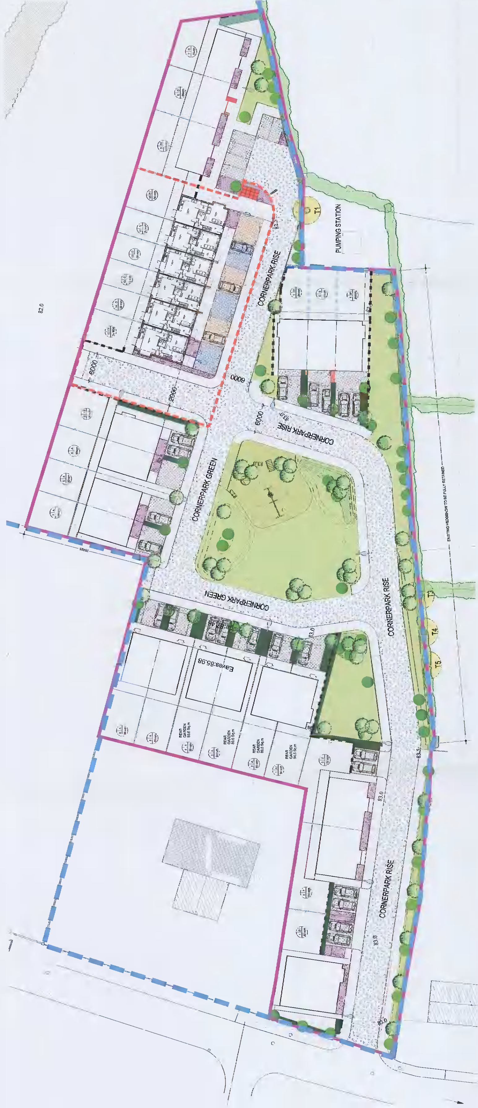
PROPOSED SITE LAYOUT PLAN CORNERPARK, NEWCASTLE. Scale: 1:500