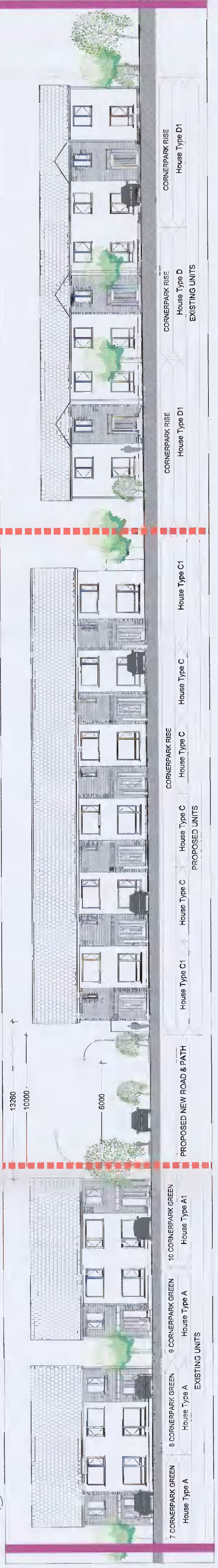
PROPOSED CONTEXTUAL ELEVATION

NOTE: PLEASE REFER TO LANDSCAPE DRAWING FOR FURTHER DETAIL REGARDING BOUNDARY TREATMENT, HARD AND SOFT LANDSCAPING AND LAYOUTS.