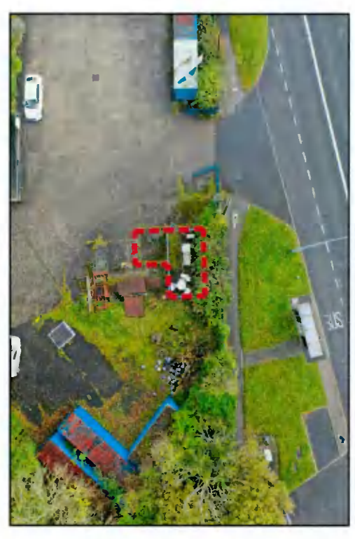
FIG 2. EXISTING COMPOUND LOCATION