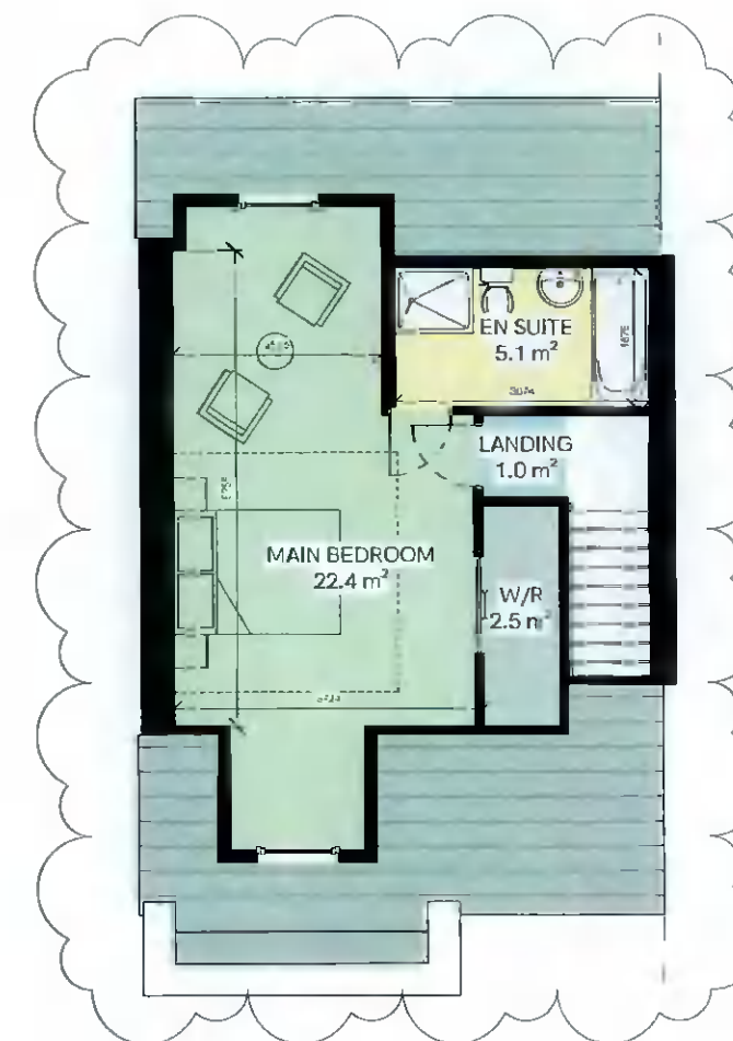
SECOND FLOOR PLAN 1:100 GIFA: 35.3m 2