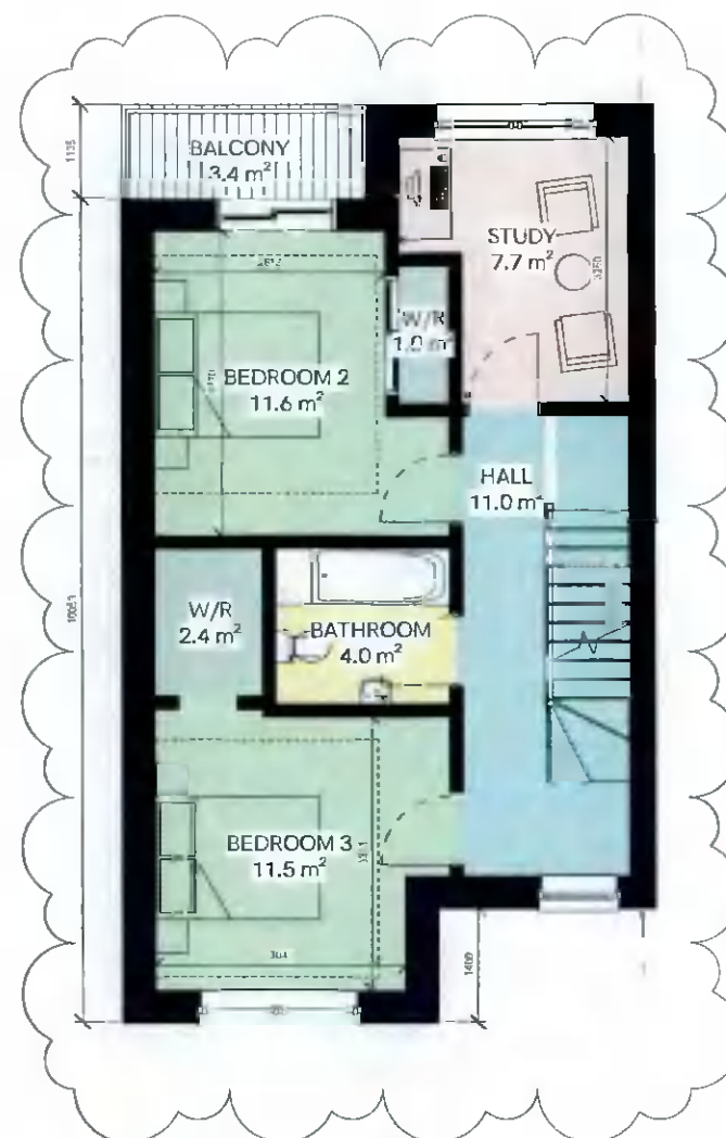
FIRST FLOOR PLAN 1:100 GIFA: 52.8m 2