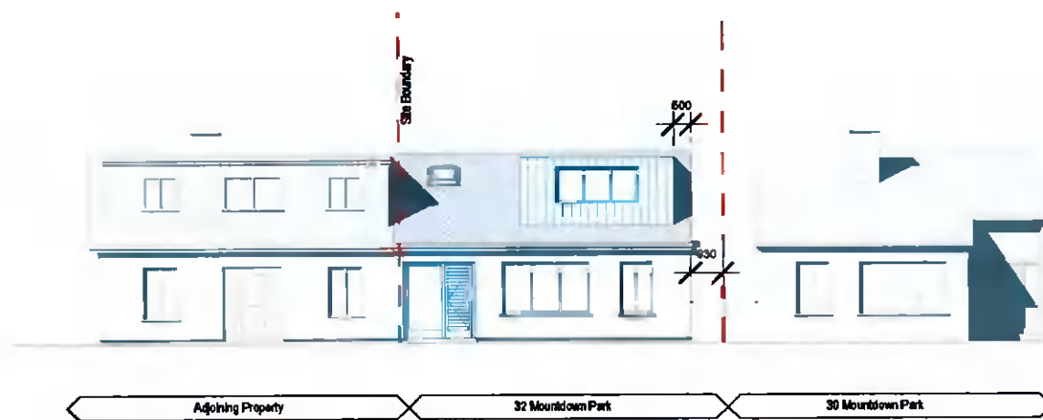
2 Contiguous Elevations Southeast Proposed 1 : 200