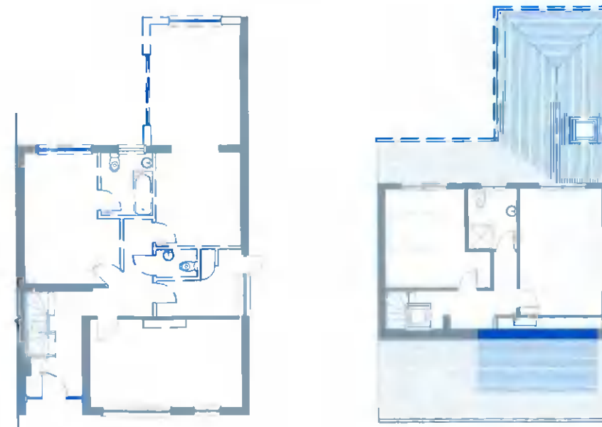
4 Level 0 Ground Floor Demolition 1 : 200

Walls, Doors, Windows & Chimney delineated in blue subject to demolition.