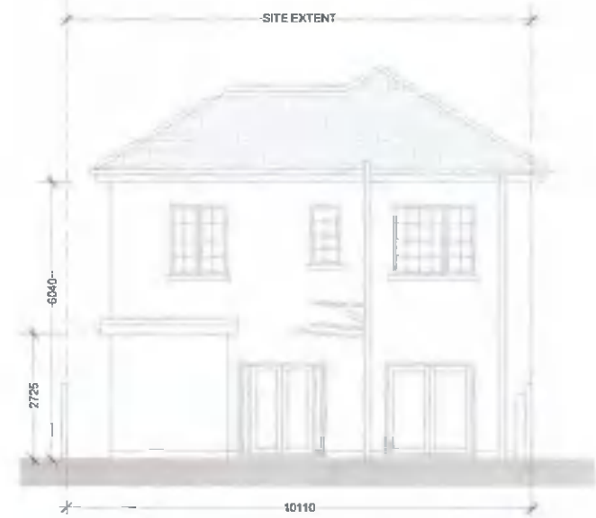
EXISTING REAR ELEVATION SCALE 1:100@A3