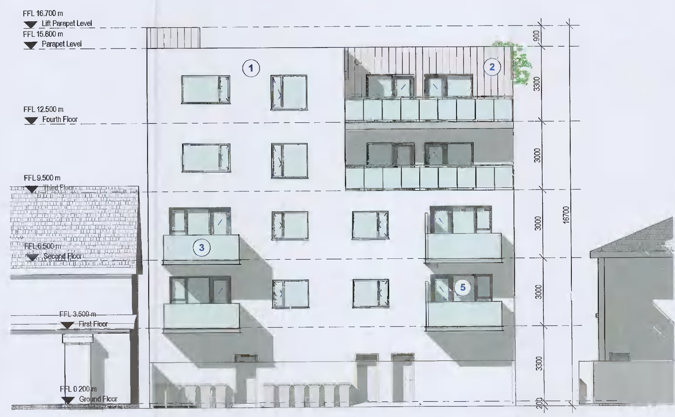
2 PROPOSED REAR ELEVATION (SOUTH FACING) SCALE 1:100