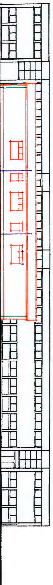
Proposed East Elevation with new Prefabricated Building Scale 1:250