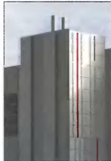
Detail of mesh cladding