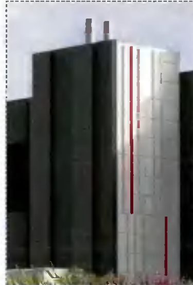
Detail of front of plenum