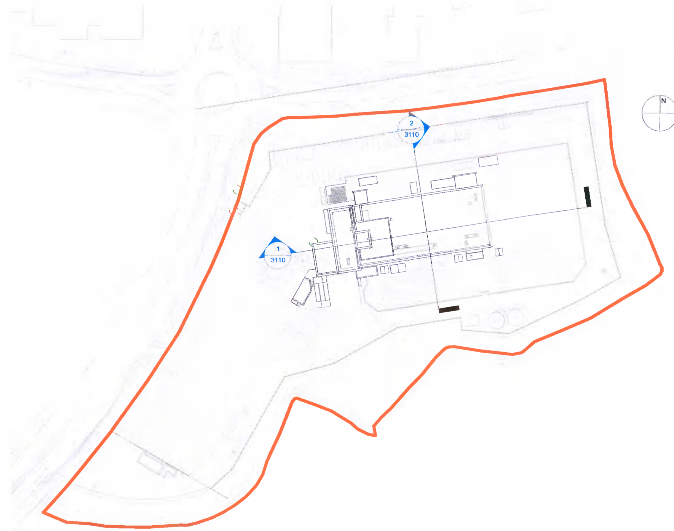
3 Key Plan 1:1000