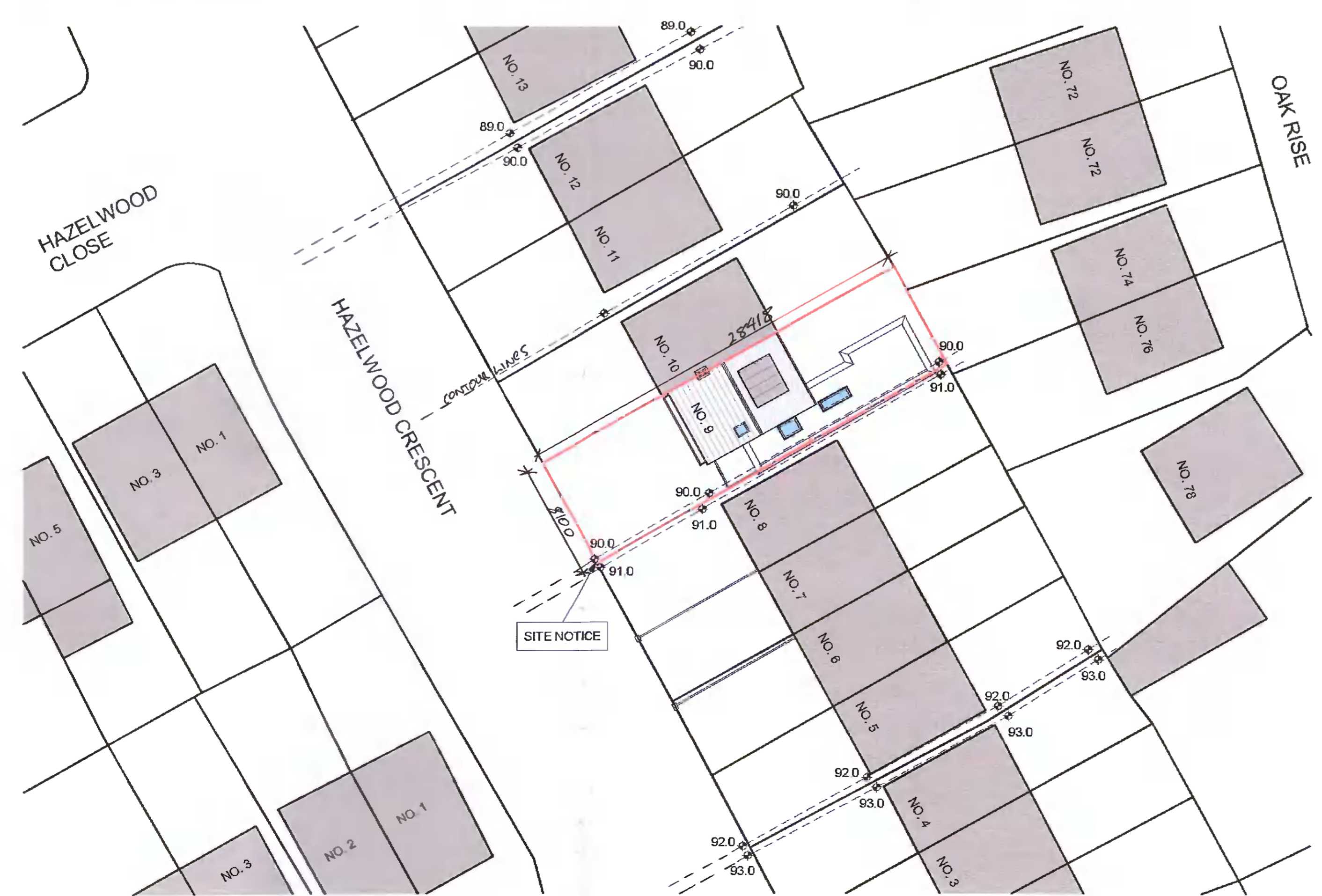
2 PROPOSED SITE/ ROOF PLAN SCALE: 1 : 250