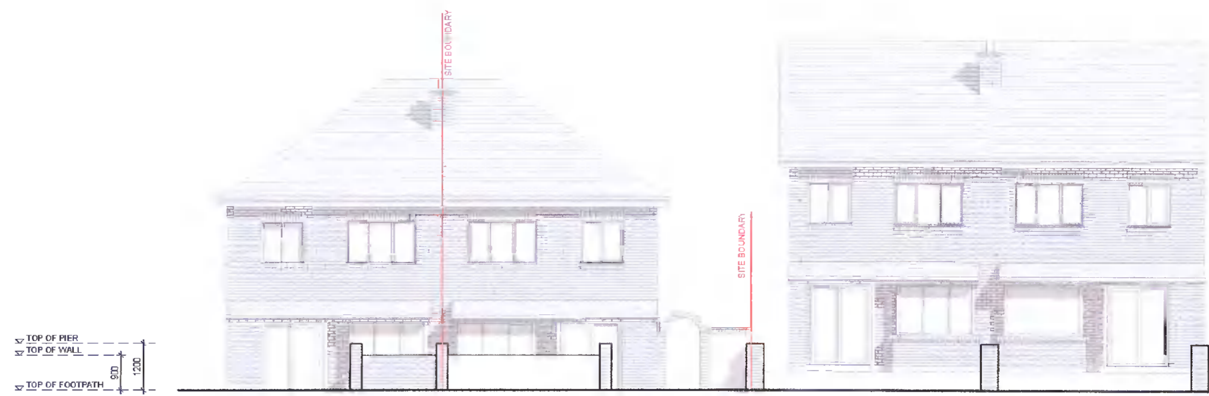
4 EXISTING CONTIGUOUS ELEVATION SCALE: 1 : 100