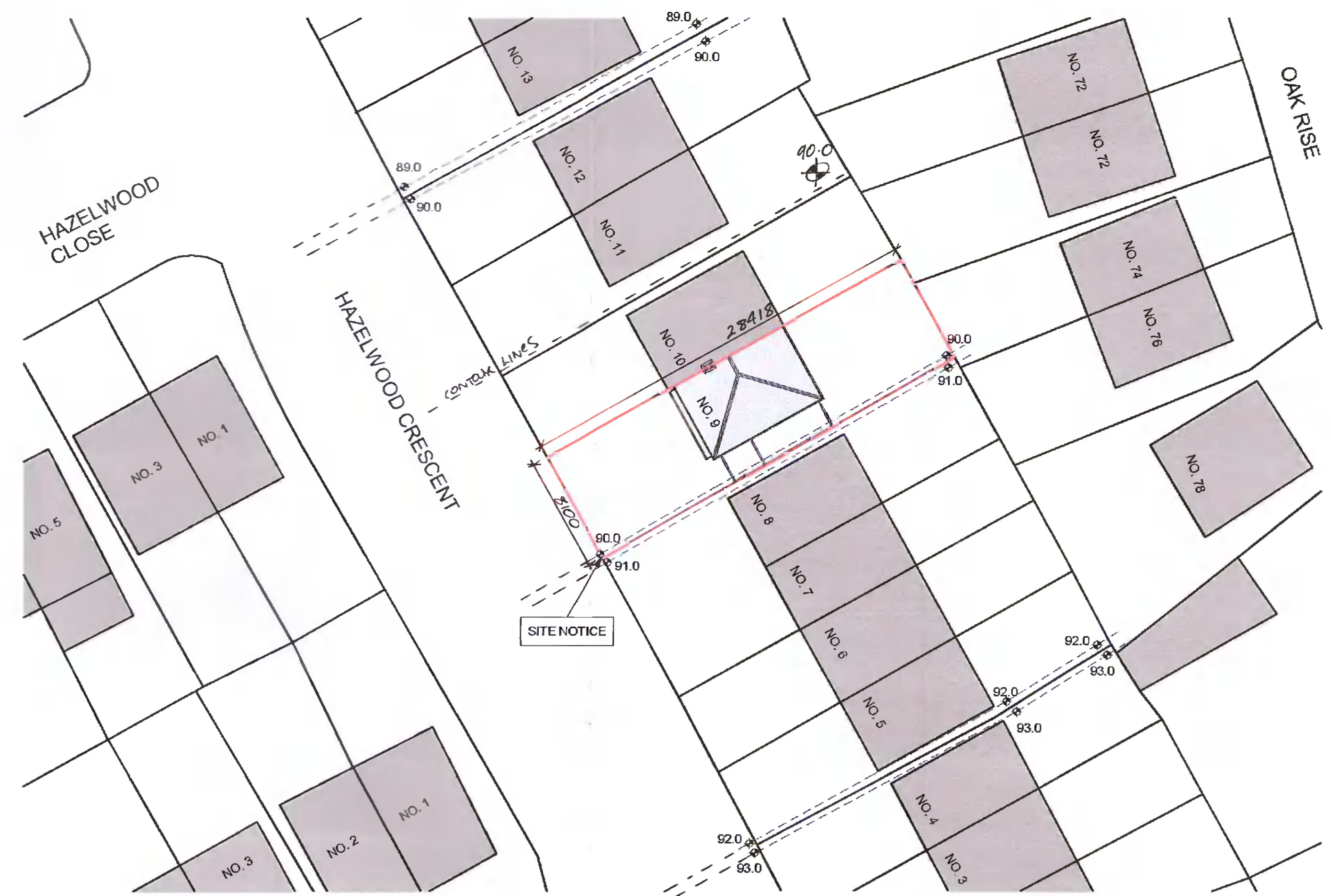
1 EXISTING SITE/ ROOF PLAN SCALE: 1 : 250