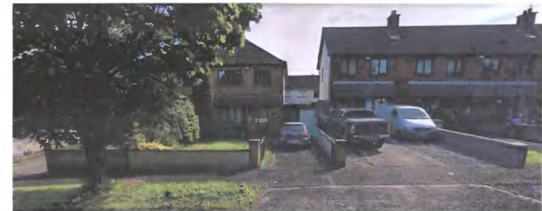
8 EXISTING STREET VIEW OF 9 HAZELWOOD CRESCENT SCALE: NTS