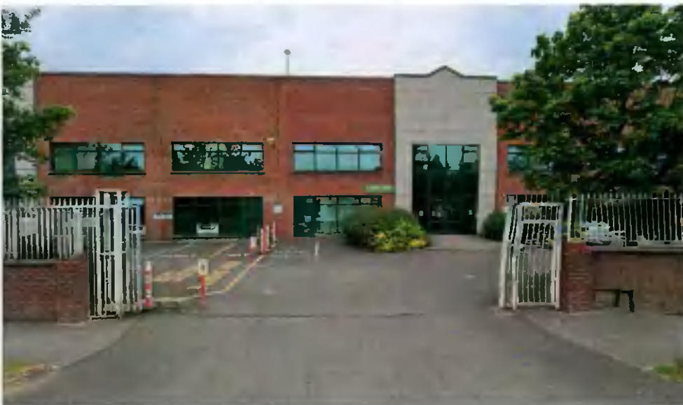
Fig 1.5. – An Post Reference