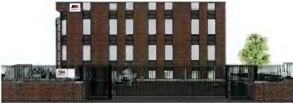
Fig 1.4. – Proposed Entrance with Gate Closed