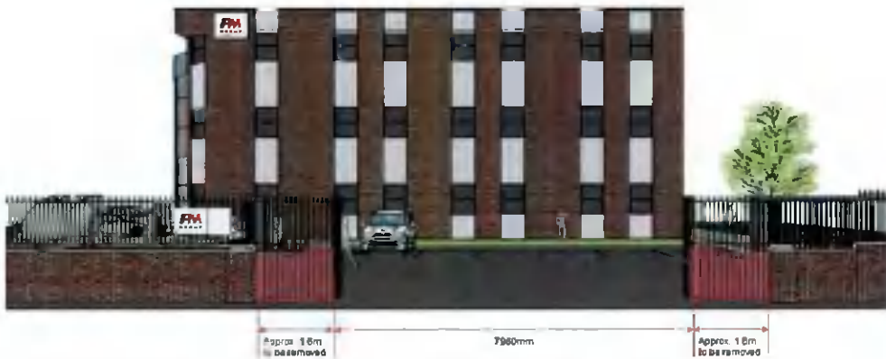
Fig 1.2. – Proposed Entrance with Highlighted Zones of Demolition