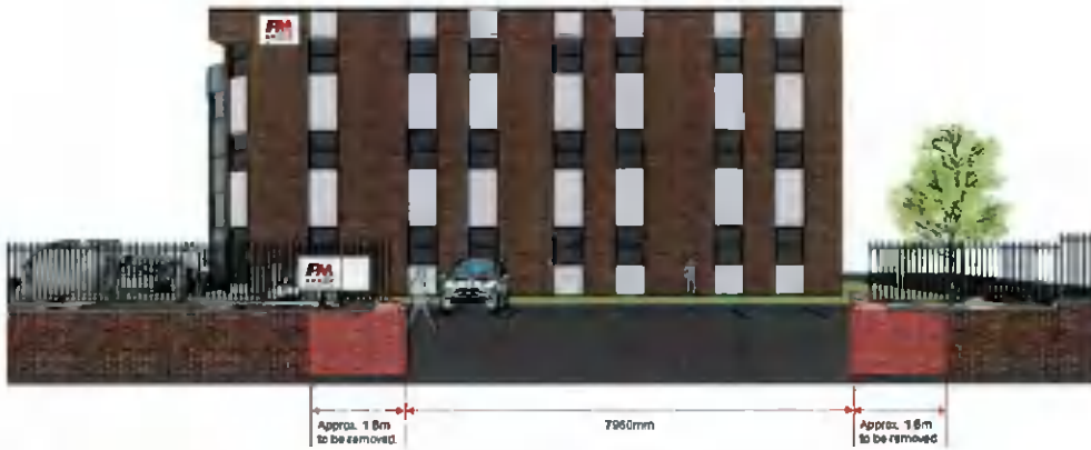
Fig 1.1. – Existing Entrance with Highlighted Zones of Demolition