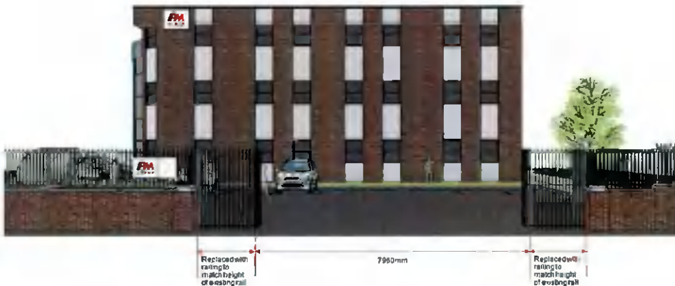
Fig 1.3. – Proposed Entrance with Gate Open