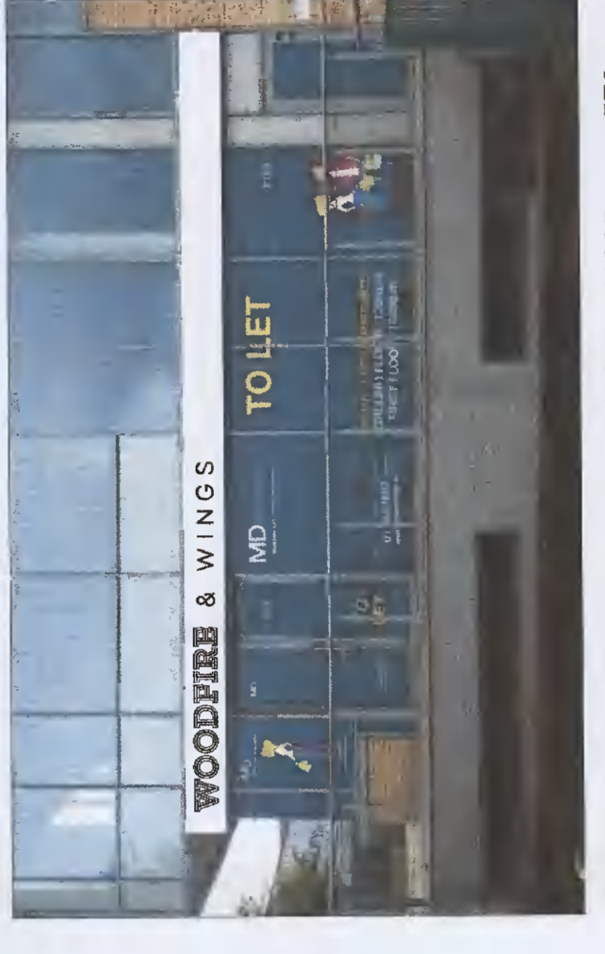
FRONT ELEVATION, SIGN DIMENSION = 11065mm x 570mm