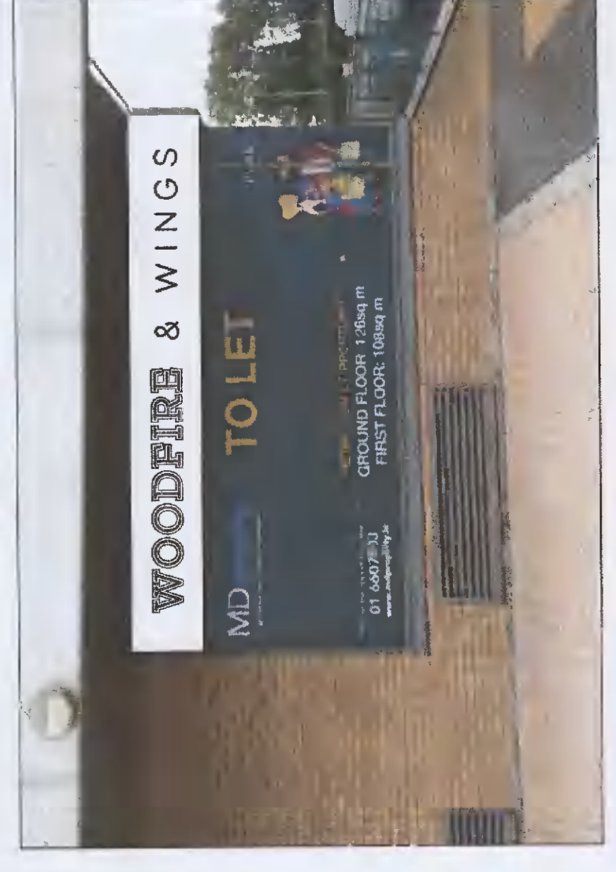
SIDE ELEVATION, SIGN DIMENSION = 4285mm x 570mm