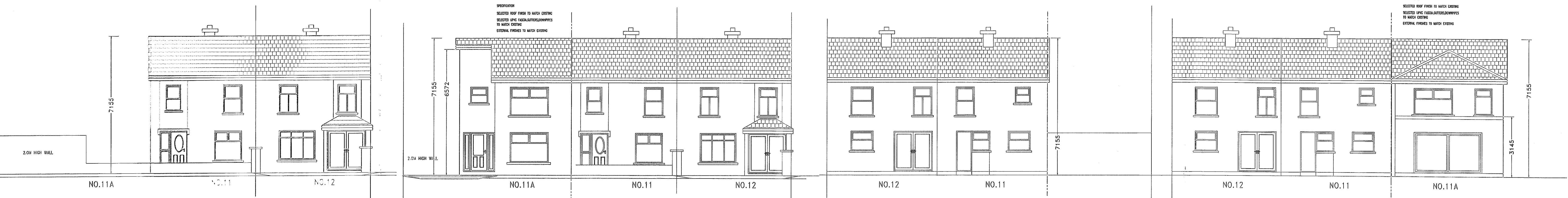
FULL CONTIGUOUS FRONT ELEVATION (EXISTING) SCALE 1:100