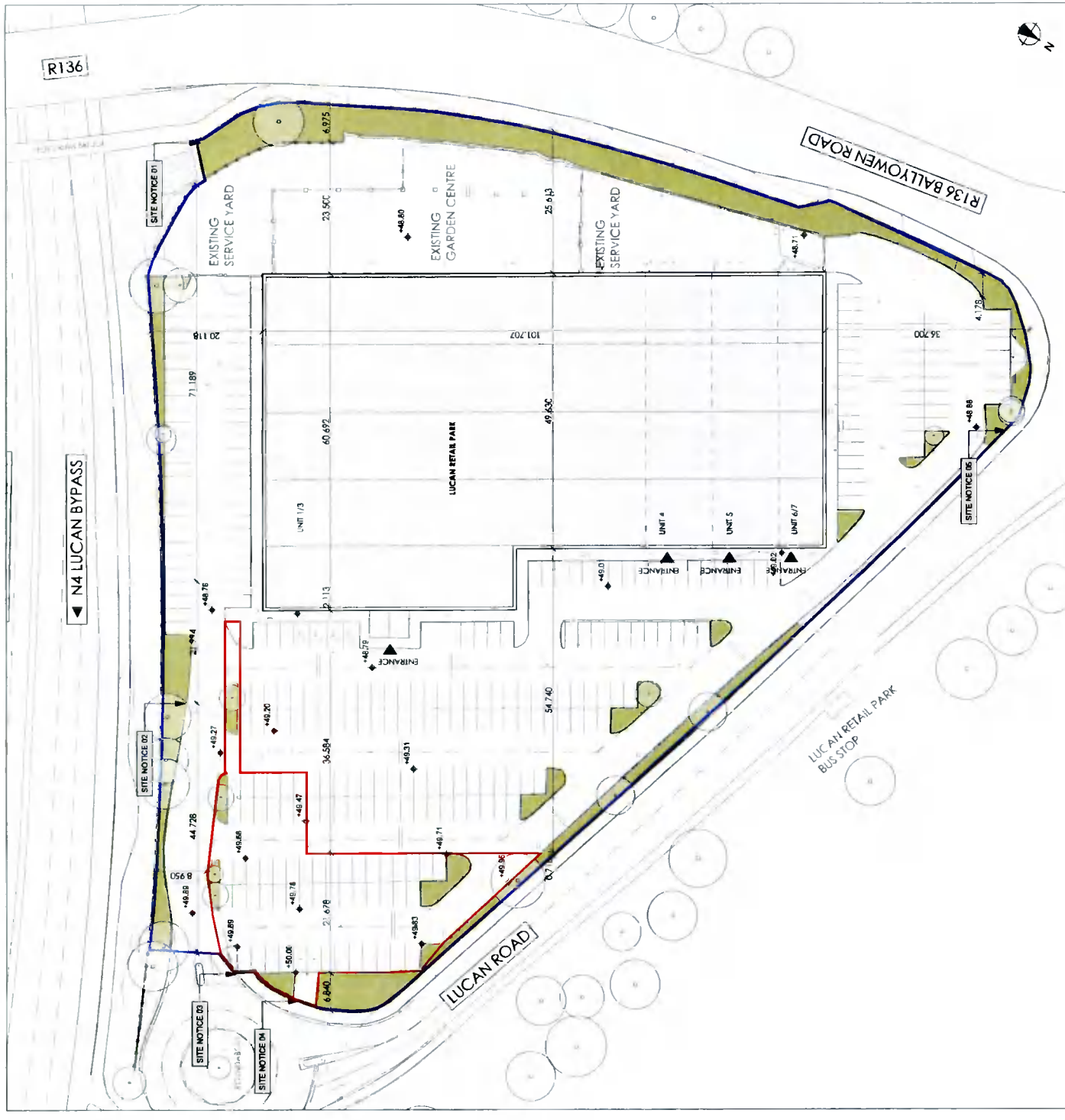
Existing Site Plan 1:500