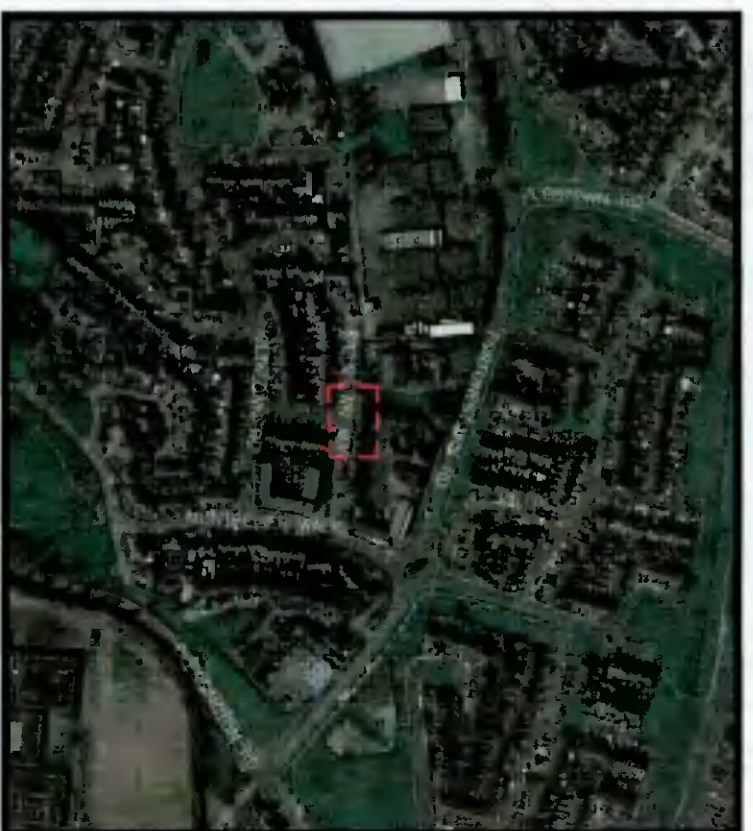
ORTHO PHOTO LOCATION MAP - INDICATIVE (NTS):