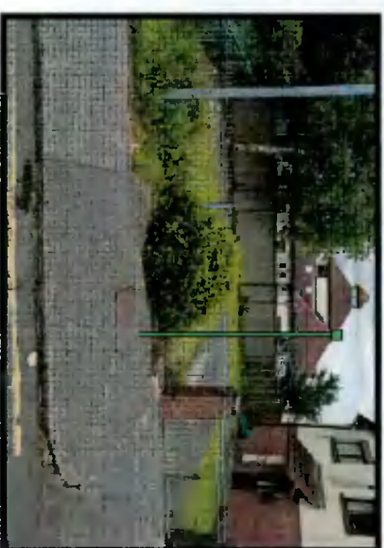
PROPOSED DRI LOCATION (NORTH FACING) - ILLUSTRATIVE PURPOSES ONLY (NTS):