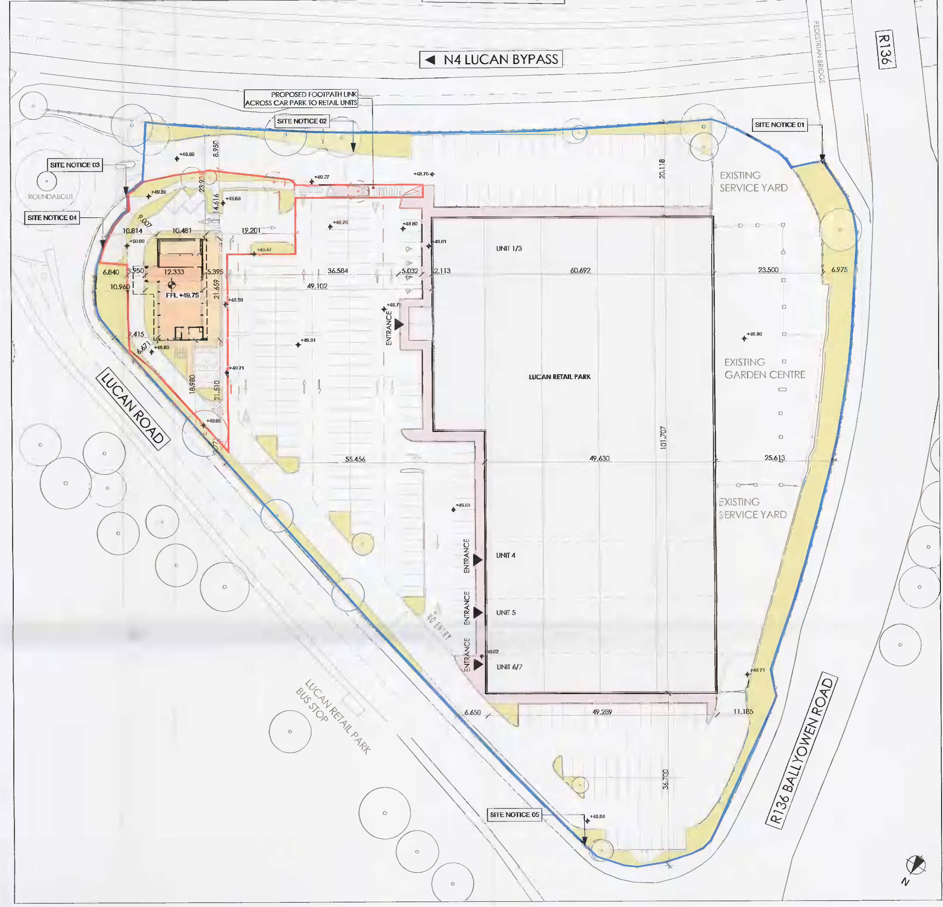
Proposed Site Plan 1:500