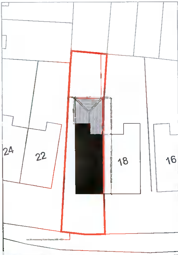
SITE LAYOUT PLAN SCALE 1:200