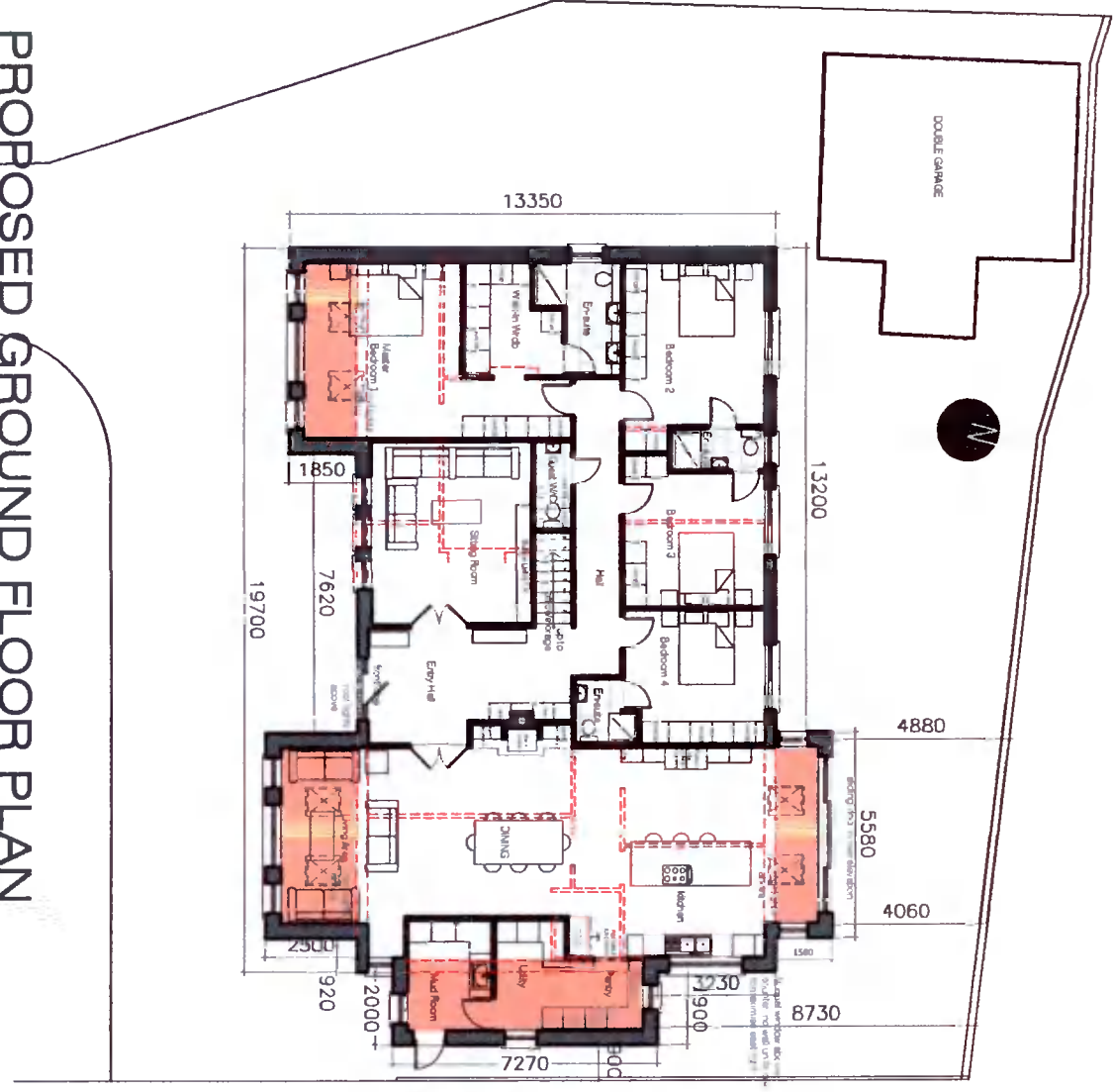
PROPOSED GROUND FLOOR PLAN Scale: 1:200