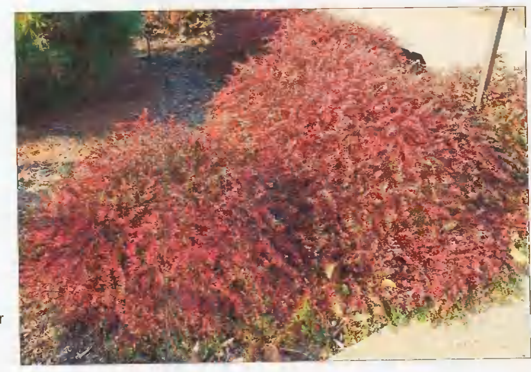
Low growing Cotoneaster