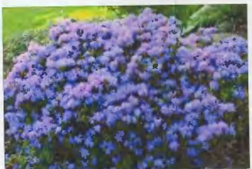
Flowering shrubs for year round interest