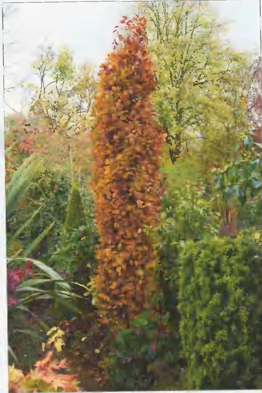
Dawycys Gold upright Beech