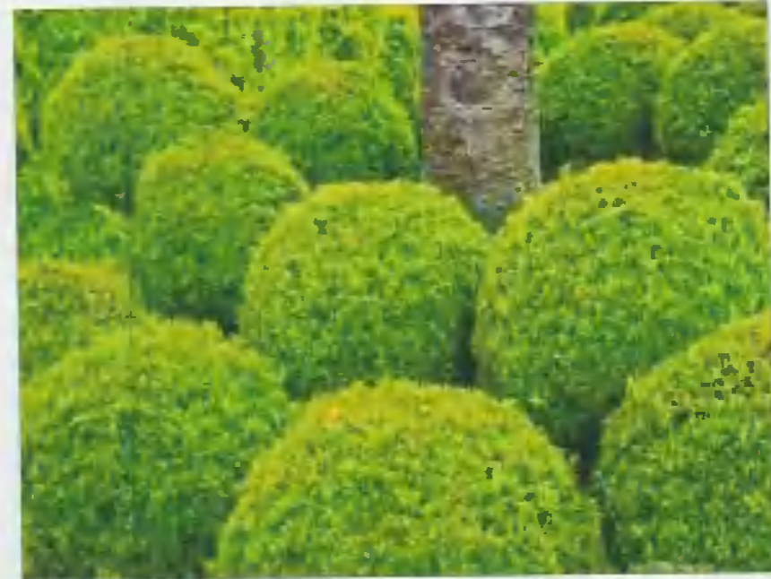
Clipped ornamental Box