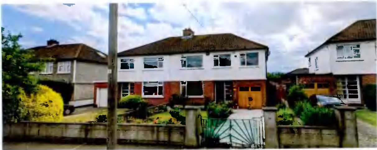
APPLICANT'S PROPERTY (LEFT) AND OBSERVER'S HOME (RIGHT)

1.1 This observation relates to a house within the mature well-established residential suburb of Rathfarnham. Ballytore Road lies a short distance south of the River Dodder and it is reached from Rathfarnham Road. Nos.40 and 42 Ballytore Road form a pair of two-storey semi-detached dwellings. They are fine typical suburban houses, laid out on the Garden City model i.e. with generously spaced with front and rear gardens, allowing ample space for tree planting and fine gardens, as shown below.