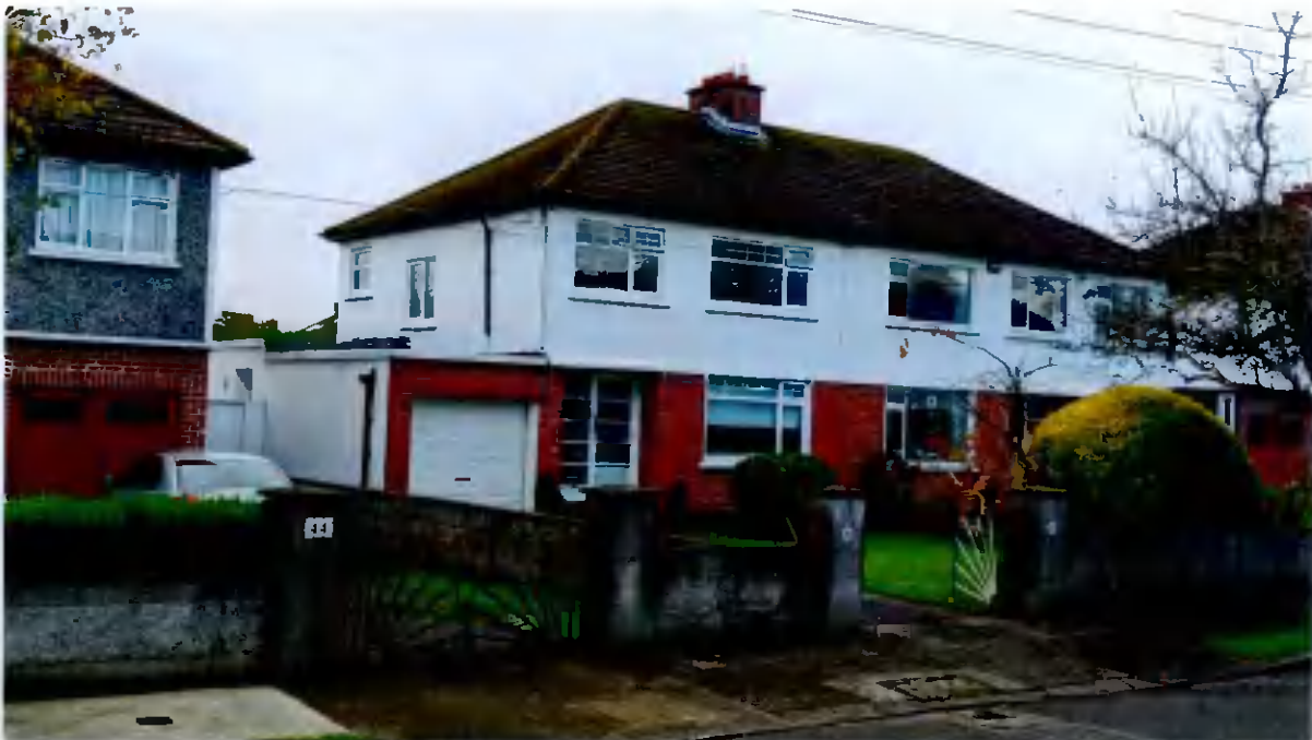
APPLICANT'S PROPERTY AT NO.42

It is also stated in the applicant's letter that the intention is to mitigate the concerns expressed by the Council regarding application ref. SD18B/0072 (described above). Clearly, mitigation alone would not meet the zoning requirement that is to protect residential amenity. To be acceptable for the zoning the proposal must satisfy the concerns of the Council regarding the protection of residential amenity at no.40. We acknowledge there are aspects of the proposal that have regard to the planning history (essentially ref. SD18B/0072) but there are too many of the previous failings still to be seen.