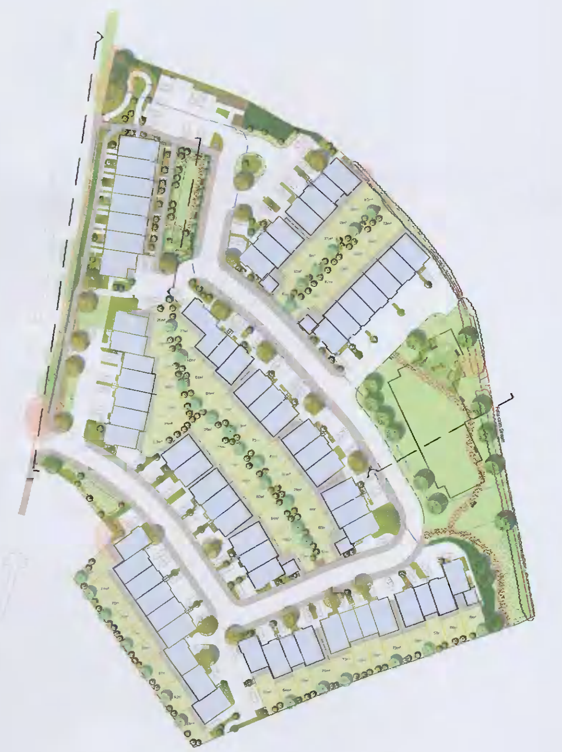
KEY PLAN NTS @ A1