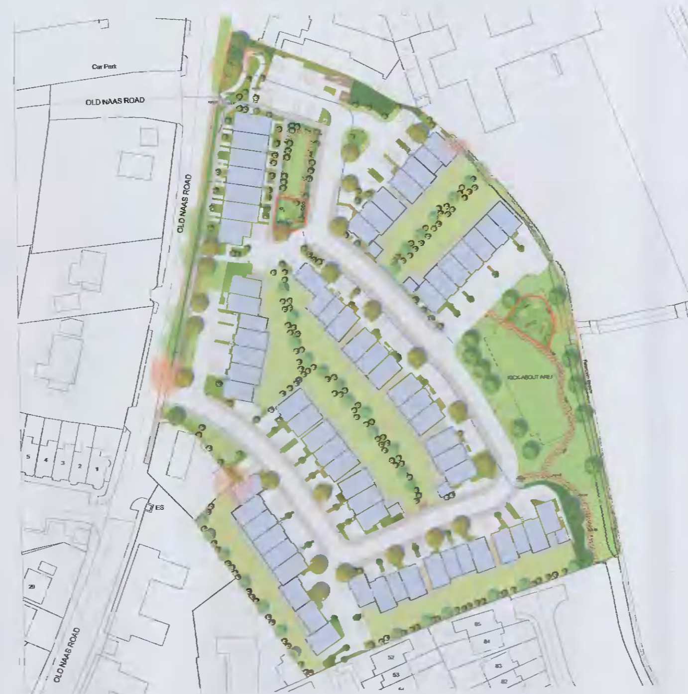
NATURAL PLAY AREA LOCATIONS PLAN - SCALE: NTS