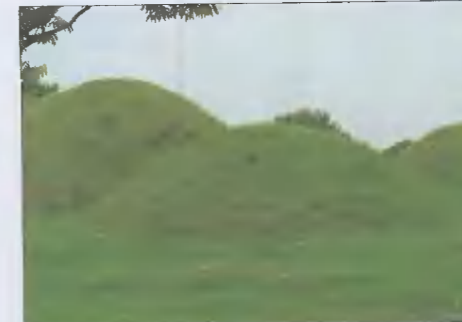
No.1 Natural Elements: Grass hills for rolling down and running up