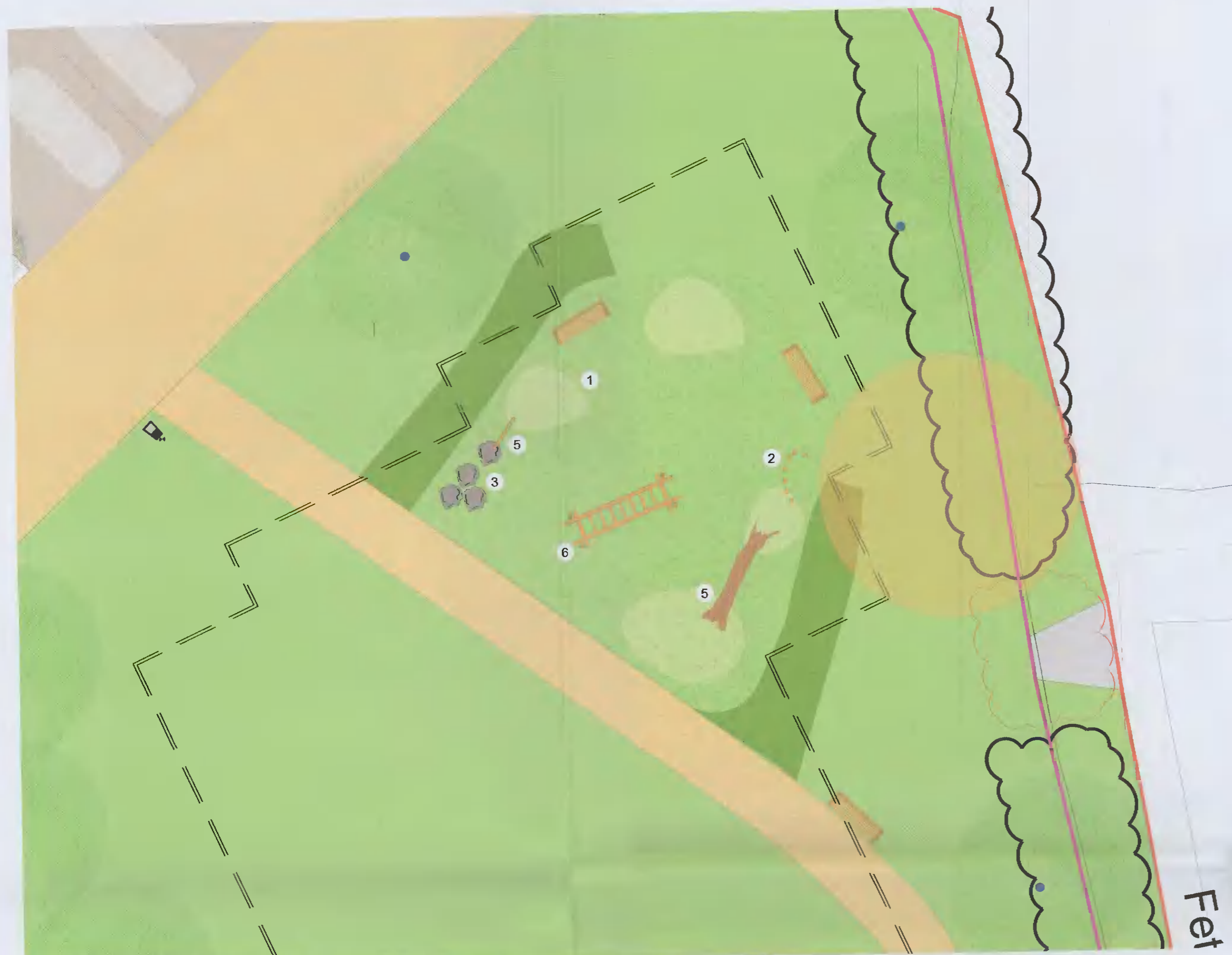
PUBLIC PARK PLAY AREA: TODDLERS + PRESCHOOL CHILDREN SCALE: 1/100@ A1