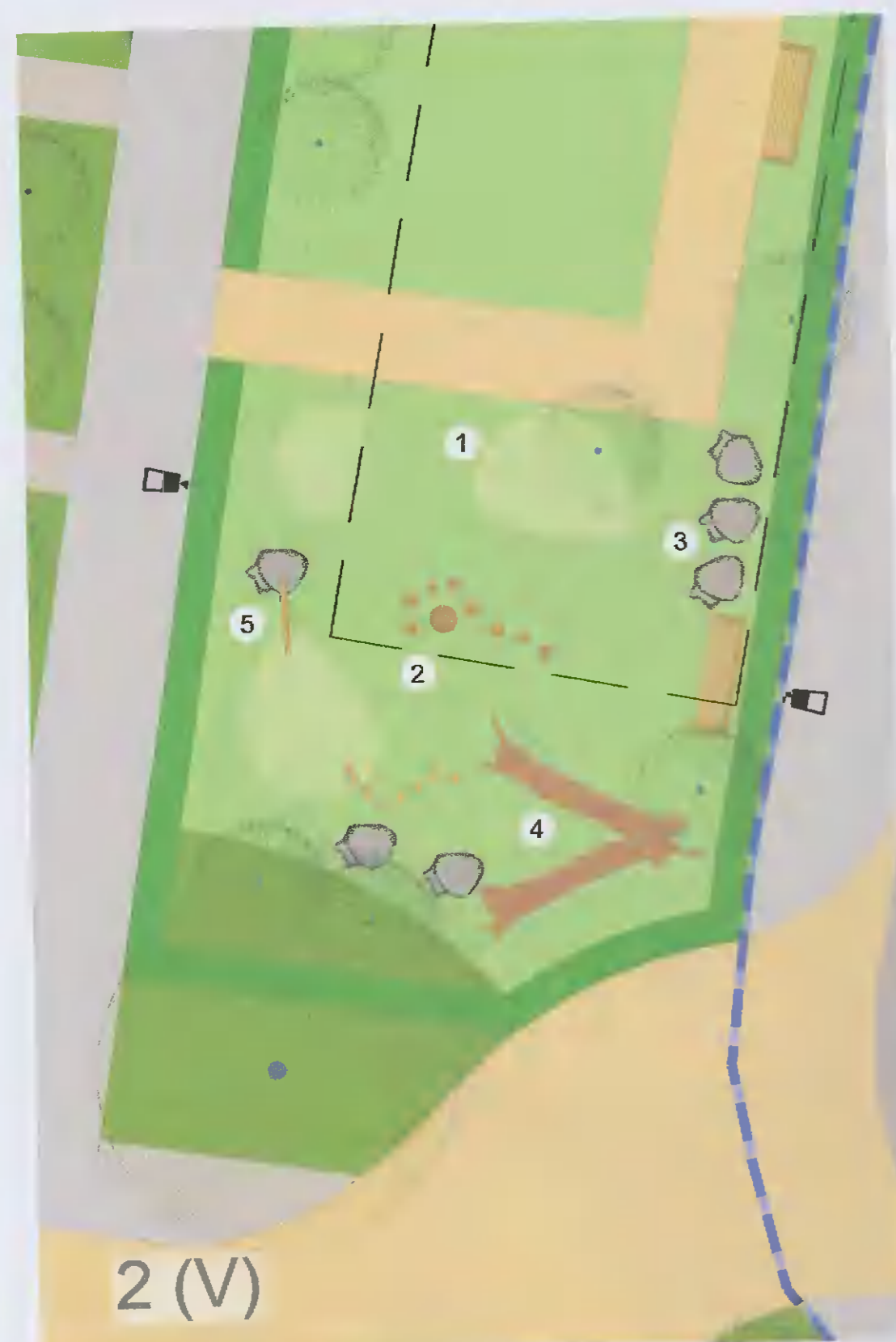
COMMUNAL PLAY AREA: TODDLERS + PRESCHOOL CHILDREN SCALE: 1/100@ A1