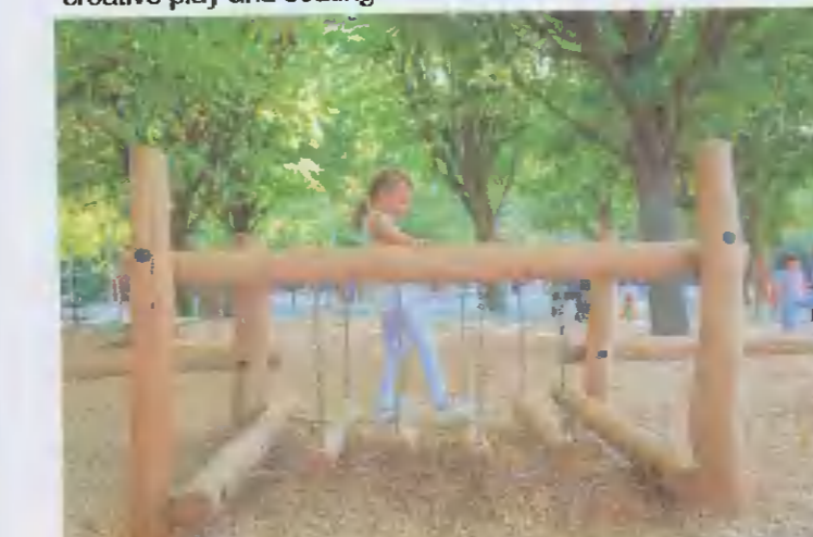
No. 6 KOMPAN NRO810 Wobble Bridge: Great for encouraging balancing