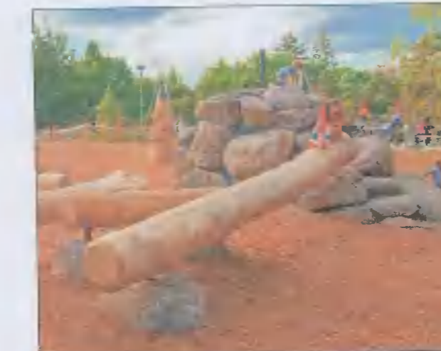
No.5 Natural Elements: Logs for balancing