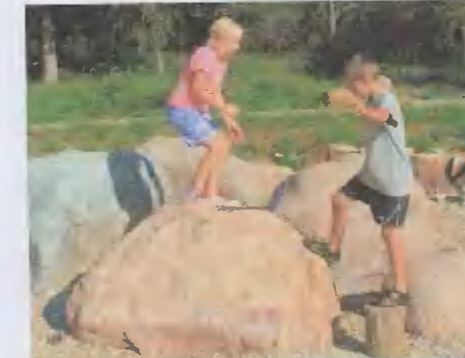
No.3 Natural Elements: Rocks for balancing