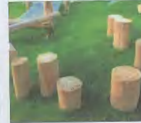
No.2 Natural Elements: Stepping logs for balancing