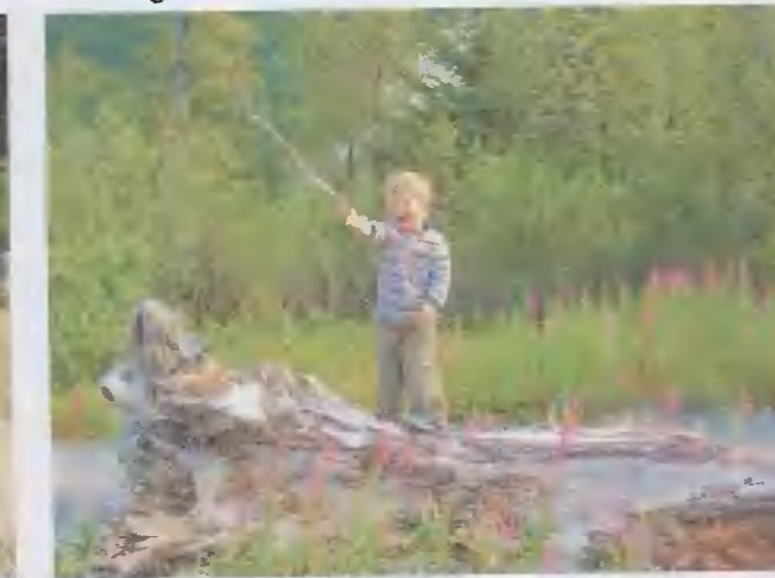
No.4 Natural Elements: Logs with bark for creative play and seating